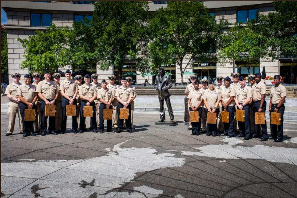
Chief Petty Officer Selects, NSF Dahlgren take a group picture with the Lone Sailor statue at the Navy Memorial Museum in Washington D.C.