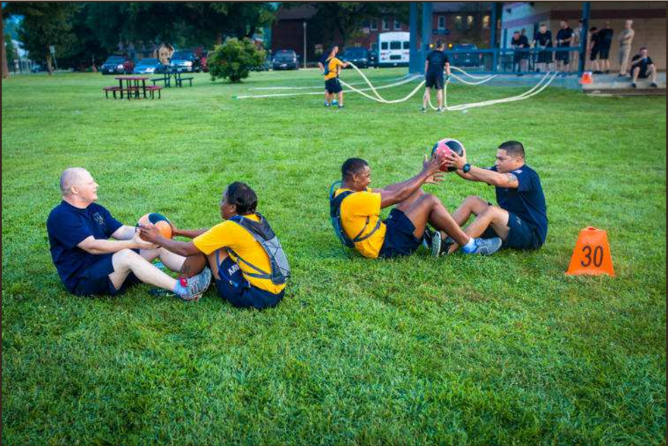
Chief Petty Officer Selects, Dahlgren participate in an early morning physical training session on Aug. 16.

The FY 2018 Navy Chief Petty Officer Selects have been very active during their first two weeks of intensive training as they prepare for the next level of their military career. In addition to a much more stringent physical training regime and academic work, the CPOS have taken time to visit sites that will help them on their path including the Navy Memorial Museum in Washington D.C. In addition to broadening their horizons and strengthening their minds and bodies, the Selects have taken part in several community support activities and fundraising ventures including a car wash and burger burn at the Dahlgren Walmart on Aug. 12 and a day at Caledon State Park to provide maintenance assistance clearing trees and cleaning up the park on Aug. 19. Keep up the excellent work Selects — Naval Support Activity South Potomac (NSASP) supports and stands behind your efforts!