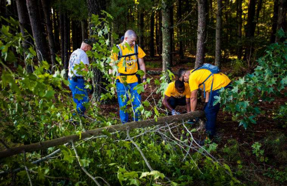
U.S. NAVY PHOTO BY FCC PHIL YEE HASANON Chief Selects provide maintenance assistance at Caledon State Park on Aug. 19.