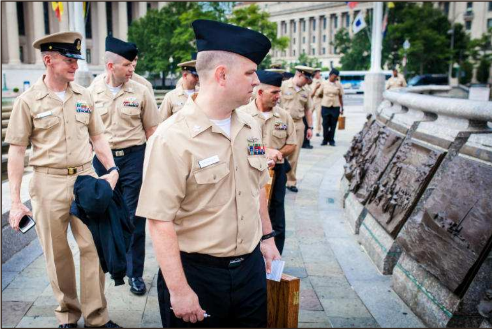
HASANON Chief Petty Officer Selects, Dahlgren visit the Navy Memorial Museum in Washington D.C.