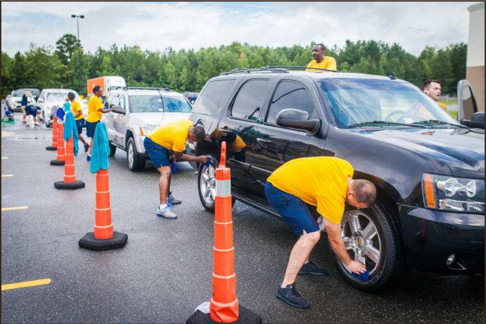
The 2018 Navy Chief Petty Officer Selects kick off their fundraising with a Car Wash and Burger Burn on Aug. 12 at the Dahlgren area Walmart.