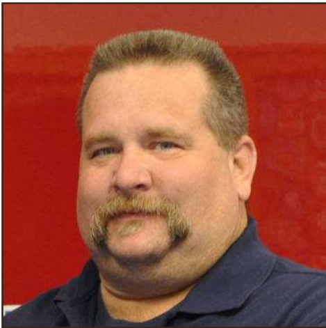
Robert Morris Sr.