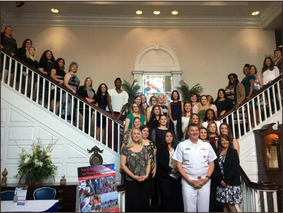
U.S. NAVY PHOTO BY Naval District Washington (NDW) Commandant Rear Adm. Charles W. Rock hosted the fourth regional Ombudsman and Key Spouses Appreciation Luncheon on Joint Base Anacostia-Bolling, Sept. 26. Five of Naval Support Activity South Potomac (NSASP) Ombudsman attended the event.