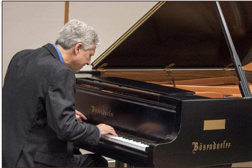
Pianist Brian Ganz Performance to Kick Off College of Southern Maryland's (CSM) 2017-18 Ward Virts Concert Series, Oct. 8.

The Ward Virts Concert Series celebrates the