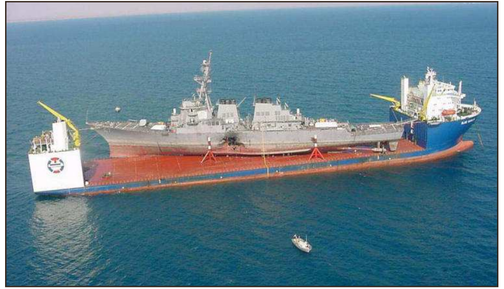
The U.S. Navy hired the semi-submersible ship M/V Blue Marlin from Offshore Heavy Transport to move the destroyer USS Cole back to the United States after the warship was damaged by a terrorist attack of suicide bombers while anchored in the port of Aden, Yemen.

Oct. 12, 2000 — USS Cole (DDG 67) is attacked by terrorists in a small boat laden with explosives during a brief refueling stop in the harbor of Aden, Yemen. The suicide terrorist attack kills 17 members of the ship's crew, wounds 39 others, and seriously damages the ship.