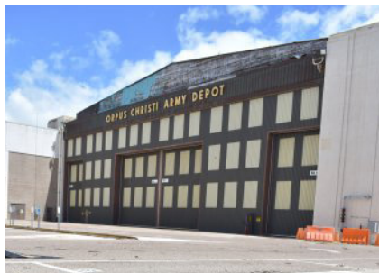
Resilient Texans Return Operations at CCAD Days After Harvey Hits