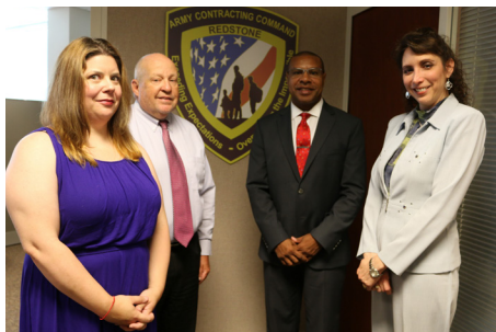
Green Platoon Concept Reaps Training Dividends for Contracting Center