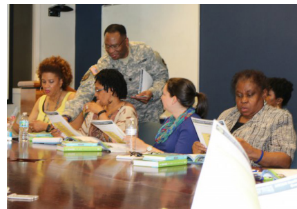
'Open Doors' Have Led Army Chaplain Through Career of Ministering to Soldiers