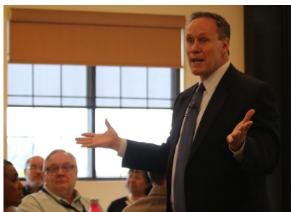
Acquisition Leaders Learn from Transformative Message