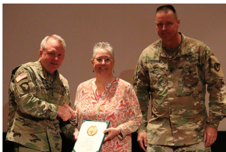
Aviation and Missile Leadership Focuses on Readiness