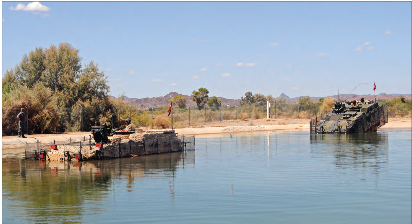
Two Piranha 5 infantry fighting vehicles undergoing a test at YPG conducted by the Danish Defense Acquisition and Logistic Organization traverse a fording basin as part of a month-long test in August. The test at put the base infantry variant of the Piranha through its paces across punishing desert terrain.

Descended from a vehicle originally produced in the early 1970s, the Piranha has evolved from an armored personnel carrier to an 8 x 8 infantry fighting vehicle. Currently used by over 20 nations, it is similar to the Stryker Combat Vehicle, which is based on the third generation of Piranha. In 2016, the Danish Defense Acquisition and Logistic Organization (DALO) ordered 309 of the Piranha's fifth