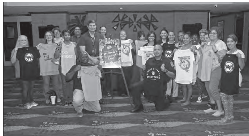
Commemorating the 97th anniversary of women achieving the Constitutional right to vote, members of the YPG workforce gathered at the Palm Garden Conference Center in late August to watch a brief documentary about Lillie Ledbetter and the Equal Pay Act. Afterwards, eventgoers pose with free t-shirts that were available to the first 30 attendees, who also enjoyed free popcorn.