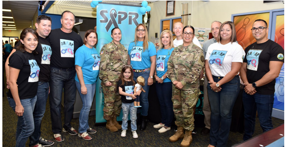
Puerto Rico National Guard representatives (L) and USAG Fort Buchanan members (R) pose for a group picture showing the collaboration between both Army components in support of the SHARP Program.