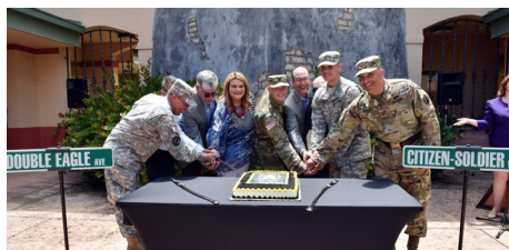
Commemorating the U.S. Army Reserve's 109th birthday the traditional cake cutting ceremony was held.