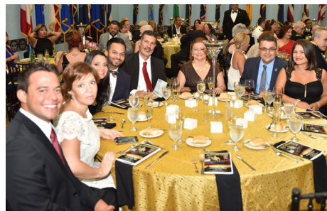
In an ambiance filled with camaraderie federal partners, local community, garrison military and civilian personnel, as seen here, members of the garrison directorate of public works and their family, celebrate together the Army's 242nd birthday day at Fort Buchanan.

He illustrated the critical role played by the US Army throughout its 242