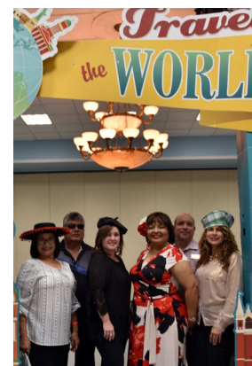
Fort Buchanan's DFMWR Army Community Services staff pose for a group photo.

The highlight of the event was a surprise for the volunteers of a Batucada, a drum group; the typical "Cabezudos", "Vejigantes" and Puerto Rican dancers on stilts.