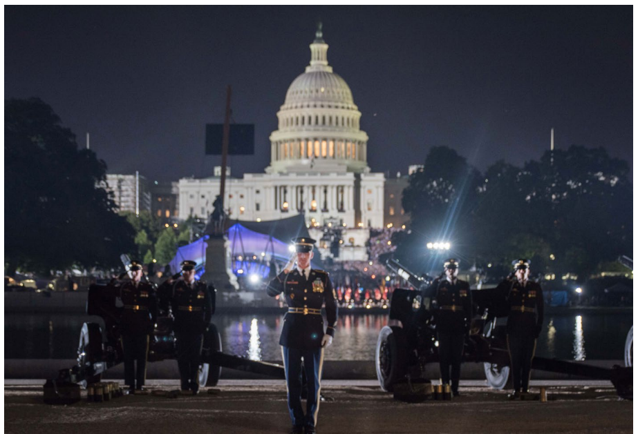
Soldiers of the 3rd U.S. Infantry Regiment (The Old Guard), Presidential Salute Battery, provides support during the playing of the 1812 Overture in Washington D.C., June 4, 2017.

To be part of this incredible professionalism and teamwork I've seeing since I arrived at the garrison and the service you provide to the nation, it is my commitment as your servant leader to look forward to sustain this synergy. That means to be always sharp and ready, like the sword that represents the Noncommissioned Officers Corps, "the backbone of the Army".