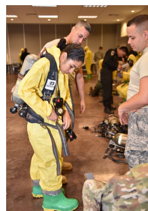
Soldiers from the 266th FD Det., 1st MSC assist each other in the donning of the PPE, ensuring that it and the self-contained breathing apparatus is installed properly and within the 10-minute time limit for completion.

On the final day of the training an intense timed testing was carried out, the 65 participants had 10-minutes