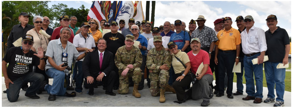
Vietnam Veterans posed for a group photo after the events held in their honor during the Vietnam Veterans Welcome Home Ceremony held at the Soldier's Plaza June 13, 2017.