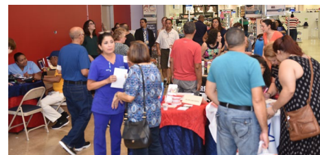
Crowds of people gathered information at the booths the RAHC set up during the Health and Wellness Fair in the Exchange main Lobby and commissary mall areas.

As visitors to the Exchange and the Commissary arrived they were greeted by the many partners who were providing some of the courtesy medical exams, as in the case of Walgreens who were doing free blood pressure checks.