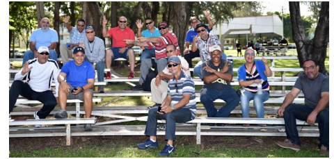
DPW staff members enjoy the camaraderie before partaking in the various sporting events of the garrison organizational day.