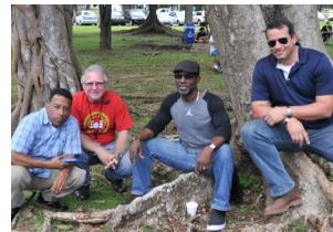
Camaraderie between garrison and tenant organizations was a highlight during the day's events.