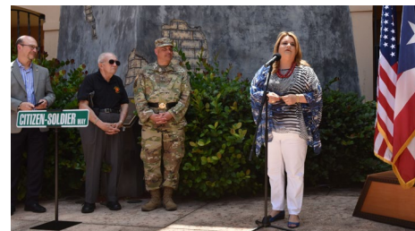
The Hon. Resident Commissioner addressed the Soldiers and attendees sharing her hopes for the installation.

It was a day filled with camaraderie among all participants in celebration of the 109th Army Reserve Birthday. The events also provided the opportunity to show visitors the partnerships among Fort Buchanan garrison and the 1st Mission Support Command as well as provided the opportunity to discuss with the Resident Commissioner the installation plans to improve its facilities.