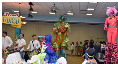
(L) A Batucada, a drum group, "Vejigante" and Puerto Rican dancers on stilts delighted the volunteers with music and dance.