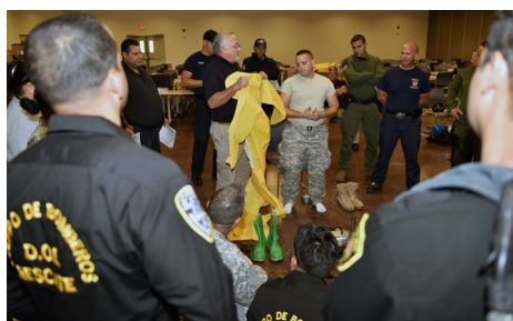
TEEX trainers walk-thru the donning of the personal protective equipment (PPE) part of the course.

"Our contribution not only targeted to provide our neighbors with such a demanding course but to be able to provide it free of cost is an invaluable asset. By assisting Texas A&M with some of the logistics we have been able to save them approximately $50k in