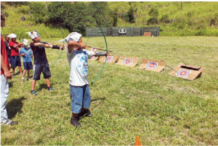
Cub Scouts draw back their bows and take aim at their targets to earn an archery badge.

Boy Scouts and family members from 20 additional Aloha Council troops volunteered to help with the day camp. Also, Soldiers from throughout U.S. Army Garrison-Hawaii lent their time and services, to include those from 74th Explosive Ordnance Disposal Company, 303rd EOD Battalion,