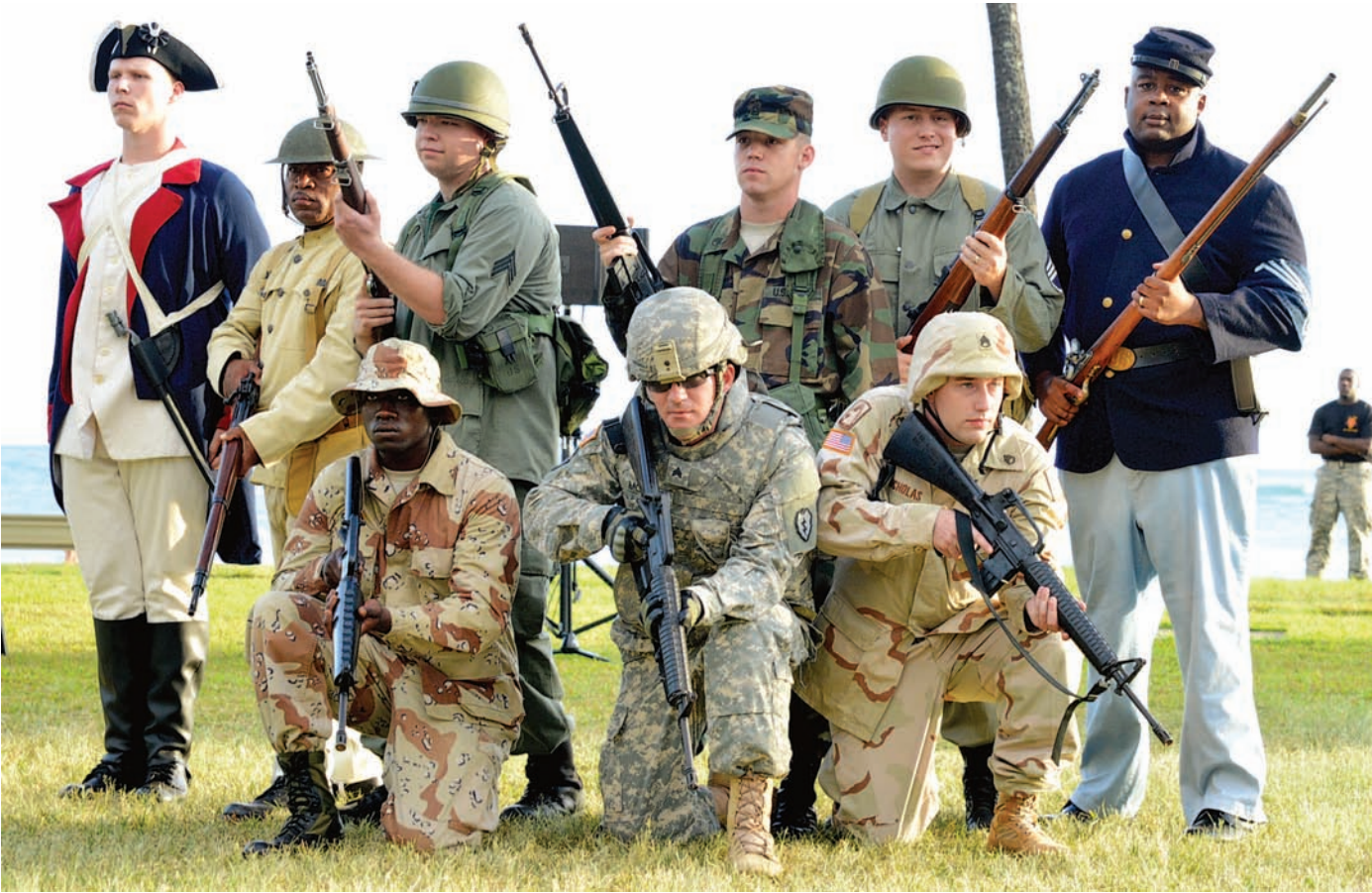
WAIKIKI — Soldiers from USARPAC Headquarters Support Company dress in historically accurate uniforms from various periods of Army history for the “Legacy of Honor” concert, a free two-night sunset musical performance held at Fort DeRussy during Pacific Theater Army Week, held in celebration of the U.S. Army’s 239th birthday.

The Mana o Ke Koa “Spirit of the Warrior” award honors individuals who have distinguished themselves by their steadfast support of Soldiers,