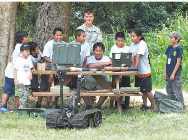
A Soldier with the 74th EOD Co., 303rd EOD Bn., 8th MP Bde., 8th TSC, helps Cub Scouts guide an EOD robot.

8th Military Police Brigade, 8th Theater Sustainment Command; 2nd Bn., 11th Field Artillery Regiment, 2nd Stryker Bde. Combat Team, 25th ID; 2-27th Inf. Regt., 3rd BCT, 25th ID; and 25th ID’s Lightning Academy. In one activity, Scouts lined up to do their best impression of Robin