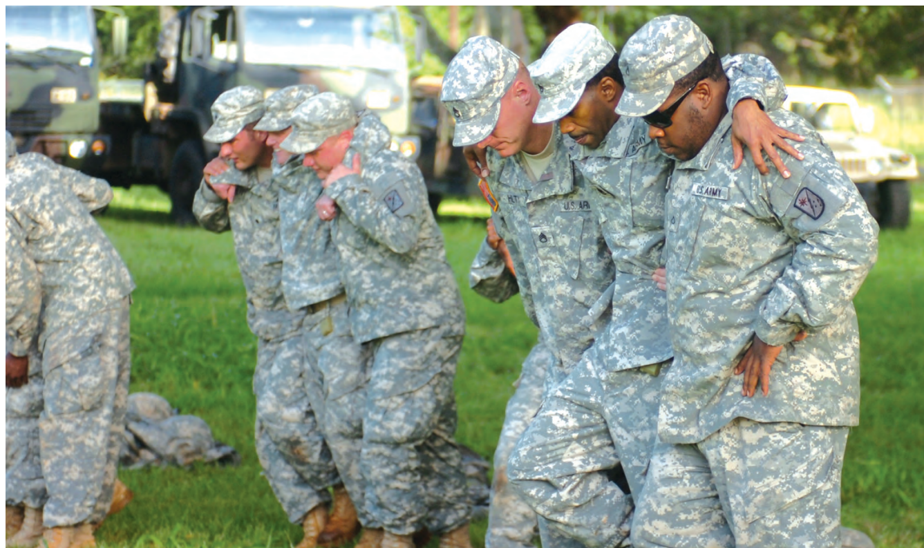
Soldiers from HHC, 45th Sust. Bde., 8th TSC, perform buddy carries during CLS training at Area X. The training was part of the practical exercise phase of CLS certification.

Engineers expect to team up with their ROK military counterparts during any exercise in country. Understanding cultural differences, including what type of behavior is and isn’t acceptable, is vital to building good relations between U.S. and ROK Soldiers.