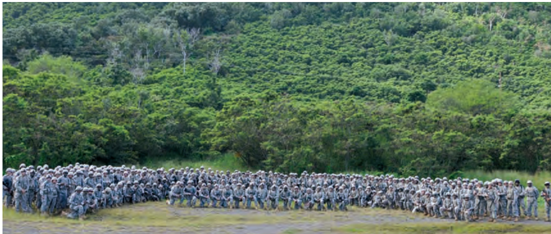
524th Combat Sustainment Support Battalion, 45th Sust. Brigade, 8th Theater Sust. Command

The battalion’s four companies – Headquarters and Headquarters Co., 25th Transportation Co., 40th Quartermaster Co. and 536th Maintenance Co. – traveled about 15 miles via tactical convoy to the training site, while the 545th Boat Trans. Co., stationed at