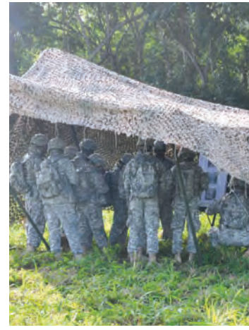
Soldiers of the 524th CSSB, 45th Sust. Bde., 8th TSC, receive instruction on Army Watercraft Operations during the battalion-wide STT at Dillingham Training Area.

“All the NCOs and Soldiers in the battalion can be very proud of the way they planned and executed this