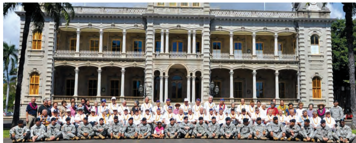
Army reservists from 9th MSC's 100th Bn., 442nd Inf. Regt., join World War II veterans from the 100th Inf. Bn., 442nd Regt. Combat Team, and the Military Intelligence Service, at Iolani Palace, March 28.

As of Dec. 31, 2010, 284 service members with Hawaii ties have sacrificed their lives while in the line of duty.