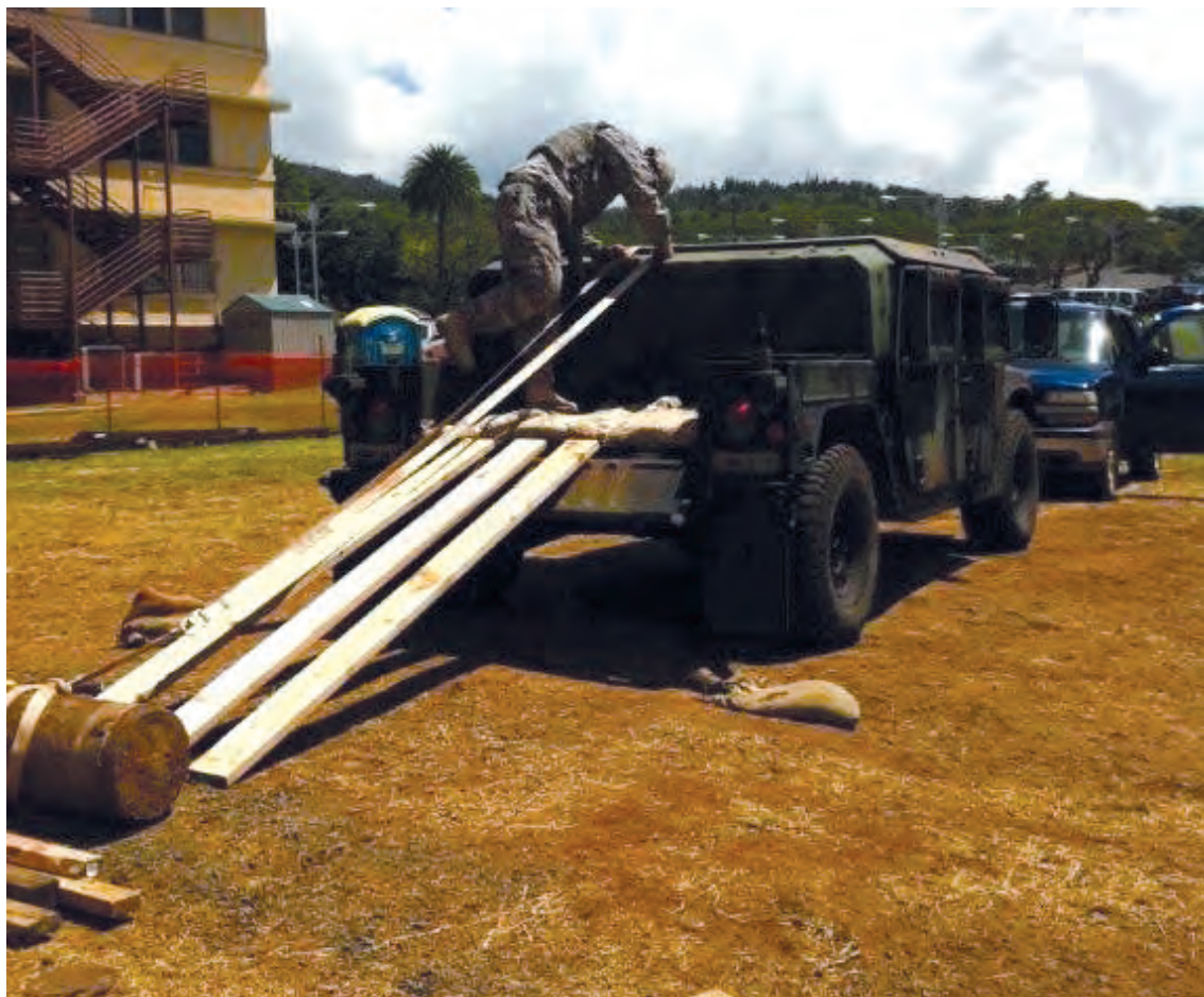
The 706th EOD Co., 303rd EOD Bn., 45th Sust. Bde., 8th TSC, response team prepares to load the World War II-era projectile into a humvee for transportation to a range on Schofield Barracks for detonation.