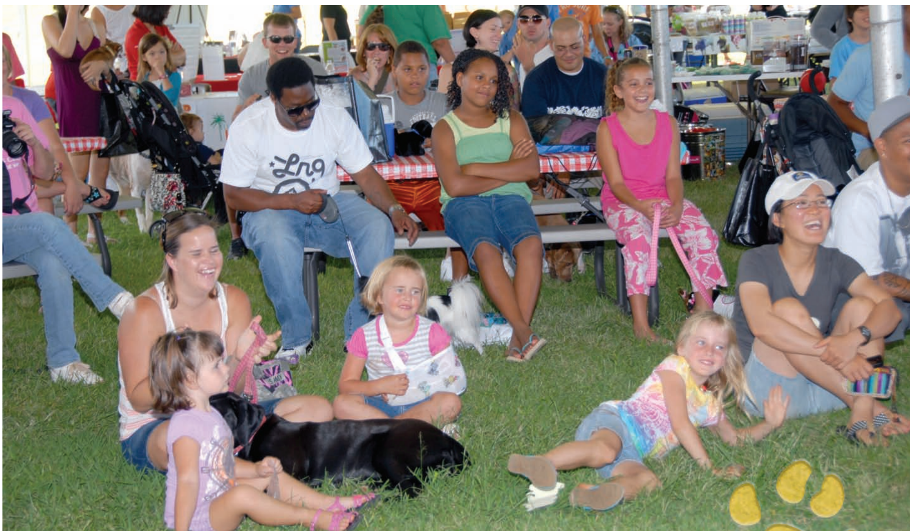
The audience watches the dog competition at "Dog Days of Summer," Saturday, at Weyand Field, Schofield Barracks. A new category, "Ugliest" dog, was added to this year's contest, in addition to the usual "Dog/Owner Lookalike," "Cutest," "Most Talented" and "Best Costume" categories. First place in each category earned a $100 gift card to a pet supply store.