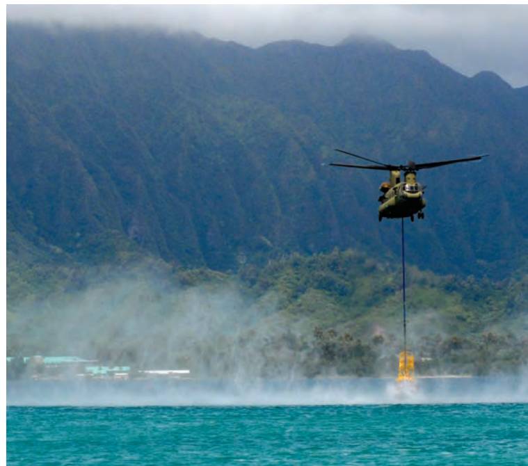
Co. B, 3rd Bn., 25th GSAB, 25th CAB, 25th ID, uses a CH-47 Chinook helicopter to transport a 12,000-pound buoy from a sandbar in Ulupau Crater to Marine Corps Base Hawaii, recently, to allow the U.S. Coast Guard to recover the buoy.