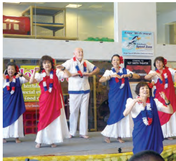
Wahiawa senior citizens perform a traditional hula.

DFMWR's Outdoor Recreation, the Sgt. Yano Library and Army Community Service also joined in on the fun to support Soldiers and families.