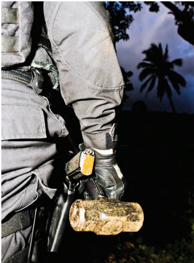
An SRT member in 13th MP Det., 728th MP Bn., 8th MP Bde., displays his tools while preparing for a certification exercise at Fort Shafter, Aug. 10.