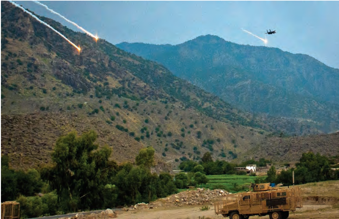
An F-15 Eagle fighter jet screams above the Pech River Valley, in eastern Afghanistan's Kunar province, for a show of force, right after a firefight between insurgents and troops from Co. D, 2nd Bn., 35th Inf. Regt., "TF Cacti," 3rd BCT, 25th ID, recently.