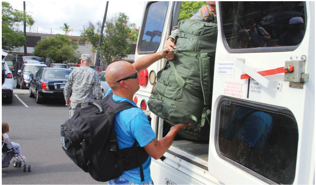
Soldier-shipmates of the 163rd Trans. Det. load duffle bags into an airport-bound bus, June 20. The Army mariners will be deployed on a nine-month mission to Kuwait to operate in the Persian Gulf and possibly outside the Straits of Hormuz.