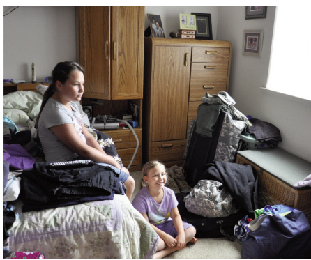
Waiting and a modicum of chaos are part of the ritual for military families and children.

"It helps to remind myself that somebody always has it better and somebody always has it worse," she added. "I've had to PCS where I had a whole year to prepare. Then again, I've heard of people who had to move in two weeks. You need a back up to a back up to a back up plan."