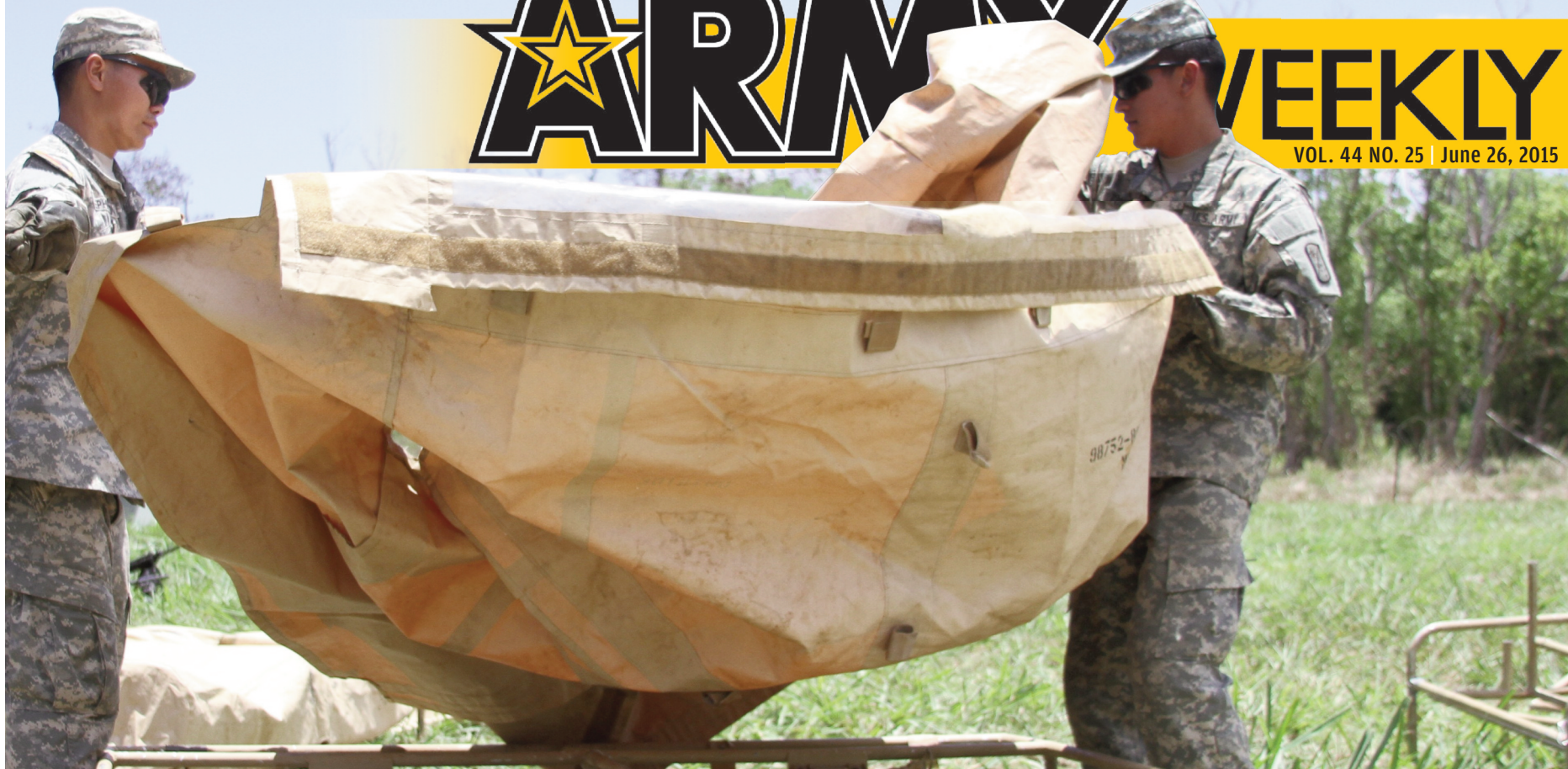
A 12-man field shower is established at Kahuku Training Area by a shower, laundry and clothing repair team from the 540th QM, 45th Sust. Bde., 8th TSC, June 16, as part of deployment training.