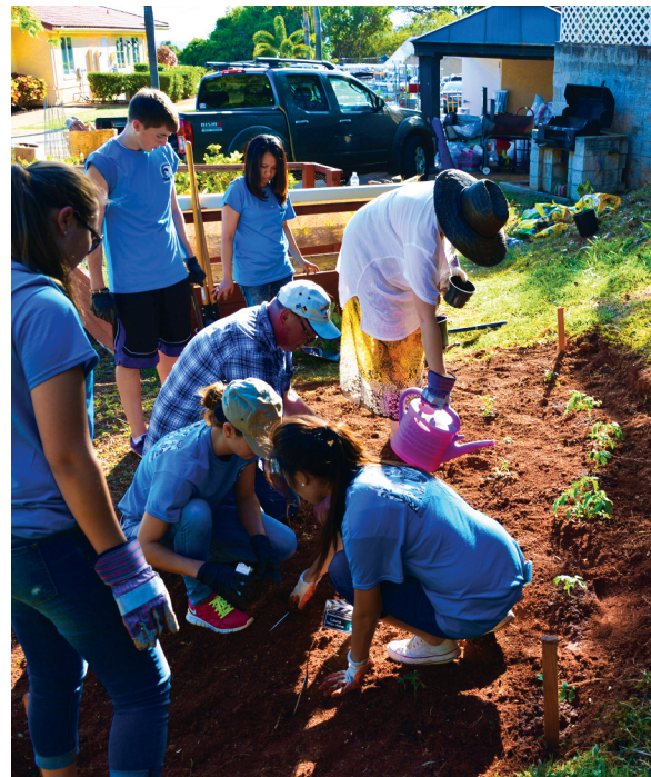
Teens participating in the IMCOM-Pacific Region Youth Leadership Forum (above) build a vegetable garden (right) at the TAMC Fisher House as part of their service project. The weeklong forum featured teens from U.S. Army garrisons throughout the Pacific region, including Korea, Japan, Kwajalein, Alaska, Okinawa and here.