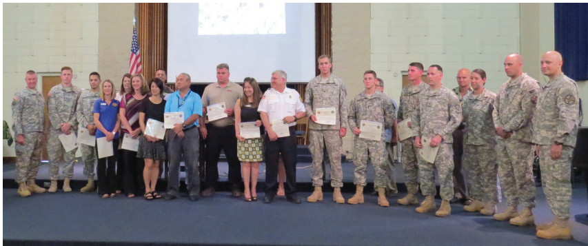
U.S. Army Garrison-Hawaii personnel are awarded certificates for noteworthy performance during the prescribed burn in May.

The Directorate of Emergency Services honored employees for helping with the prescribed burn, too.