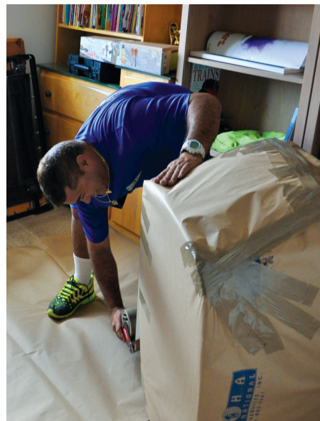
Moving day can add new layers of stress to families as the number of bodies inside the home suddenly multiplies.