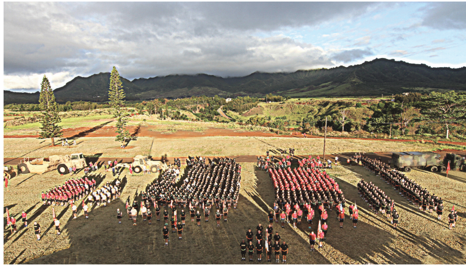
The 130th Eng. Bde. forms up for the 2015 Engineer Regiment Muster Run. More than 2,000 Soldiers, family members and pets made the run through Area X-Ray.