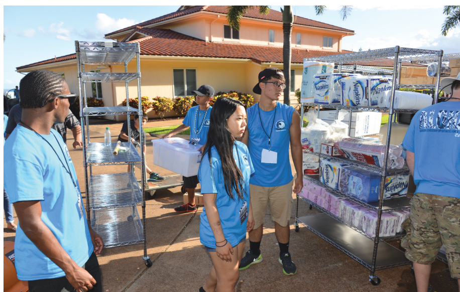
Teens participating in the IMCOM-Pacific Region Youth Leadership Forum reorganize a large storage area at the TAMC Fisher House as part of their service project.