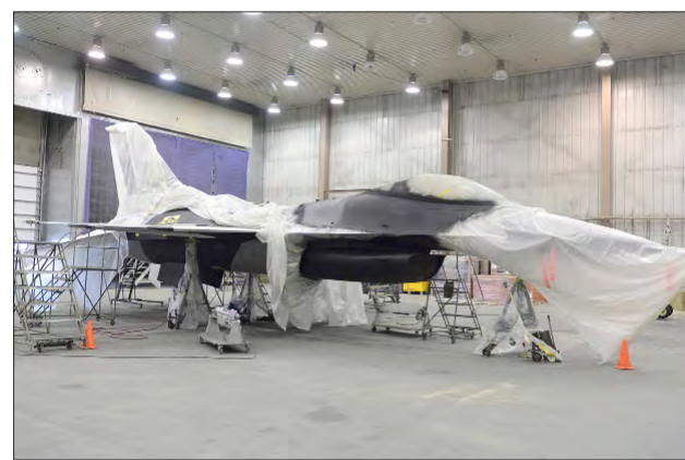
A U.S. Air Force F-16 Fighting Falcon aircraft sits in a hangar April 4, at Eielson Air Force Base, Alaska. The F-16 is being painted with the new "Splinter" paint scheme by the 354th Maintenance Squadron's structural maintenance repair section.

Expect to see a few fresh looking paint jobs out on the flightline in the coming months, especially as Eielson begins gearing up for RED FLAG-Alaska season, where U.S. forces and their allies will continue