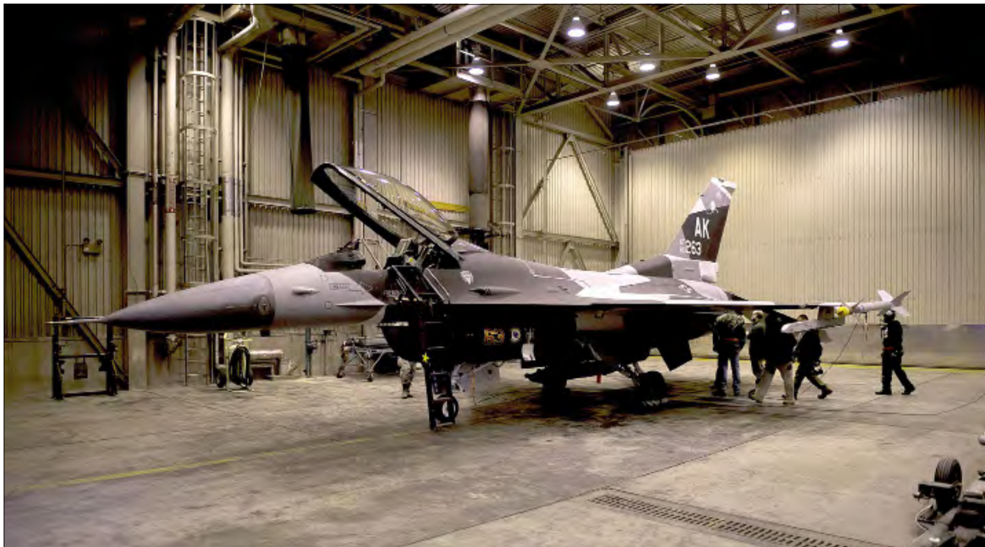
A U.S. Air Force F-16 Fighting Falcon aircraft sits in a hangar April 4, at Eielson Air Force Base, Alaska. The F-16 recently received a new paint scheme called "Splinter," which is being adopted as the standard pattern for the 18th Aggressor Squadron's aircraft.