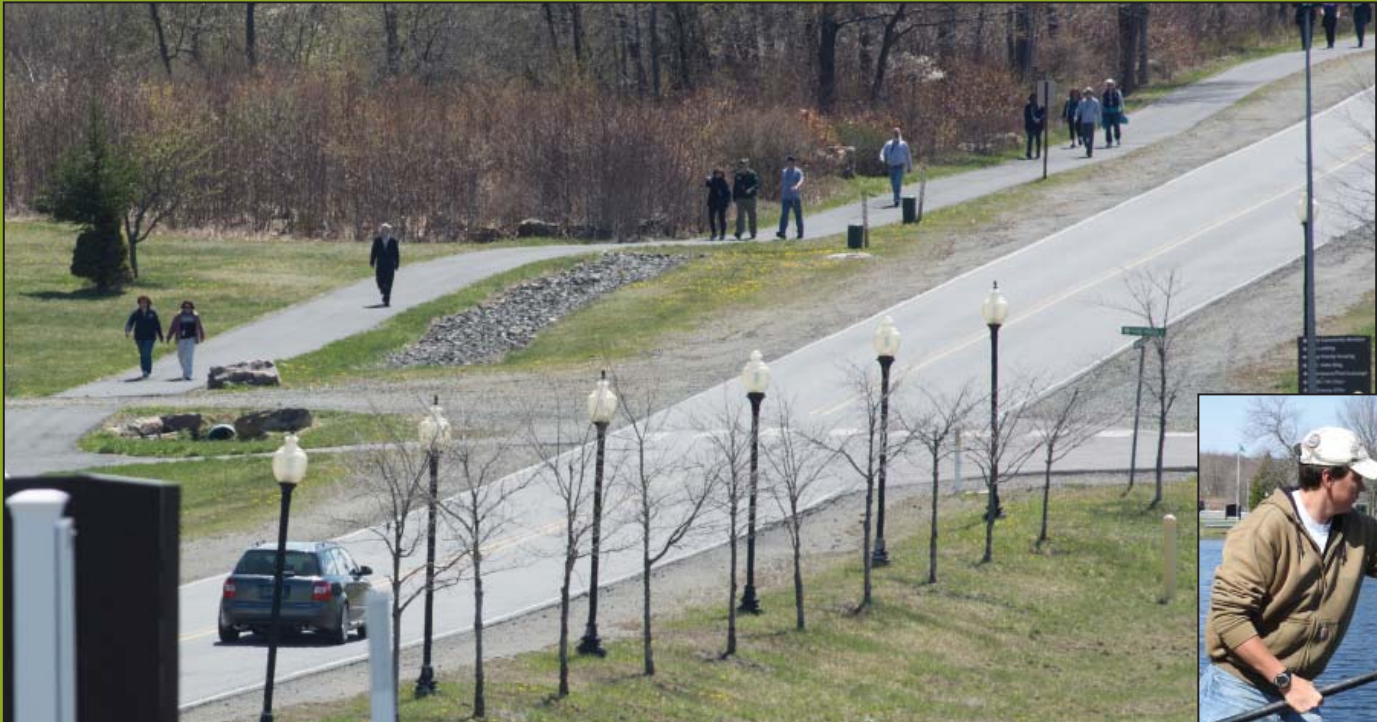
Warm weather welcome Clockwise, Team Tobyhanna personnel stepped into spring by participating in three annual events during April. The Prevention and Wellness Group’s walking event saw dozens of people trek from the Mack Fitness and Recreation Center, along the walking path on Hap Arnold Boulevard, around the Tobyhanna Villas and back. Spring Cleanup volunteers fill more than fifty 55-gallon trash bags, plus pallets with larger items. Barney’s Lake is stocked with 800 Rainbow trout, ranging from 11 to 16 inches.