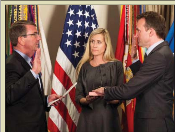
President appoints new Army Secretary Defense Secretary Ash Carter swears in Eric Fanning as the 22nd Army Secretary during a ceremony at the Pentagon, May 18. “This is a challenging time for our nation and for our Army. My highest priority will be working to ensure Soldiers receive the necessary resources and training to remain the greatest land power in the world. I am confident our Army will fight and win wherever our nations asks, whenever our country calls,” Fanning said in a quote posted to his Army.mil website. As Secretary of the Army, he has statutory responsibility for all matters relating to the United States Army: manpower, personnel, reserve affairs, installations, environmental issues, weapons systems and equipment acquisition, communications, and financial management.

To learn more about the PMP certification go to www.pmi.org . For more information on project management training opportunities at the depot, contact a supervisor or the Resource Management Directorate’s Employee Development Division, X56620.