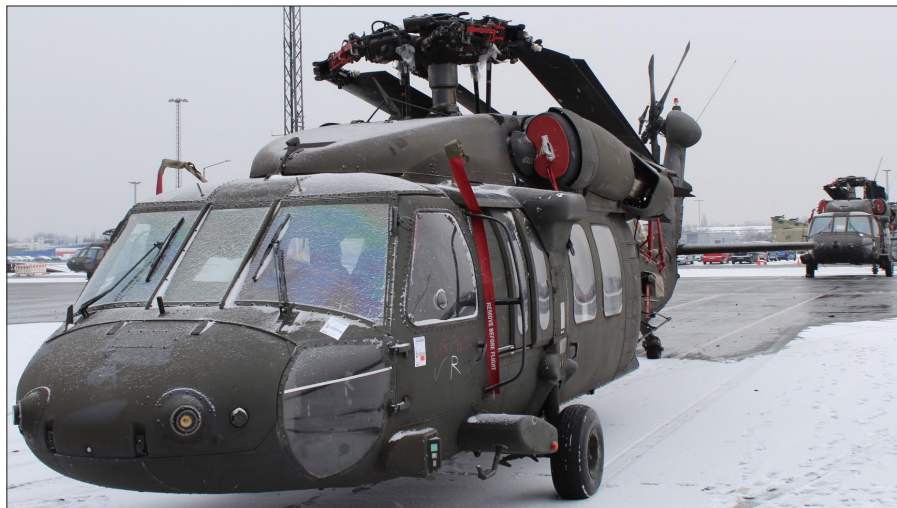
The Surface Deployment and Distribution Command received and staged the first set of the 10th Combat Aviation Brigade's Chinook and Black Hawk helicopters, Feb. 11, 2017, at Bremerhaven, Germany.