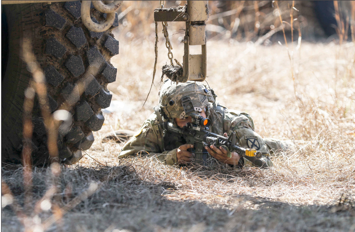
Left A Soldier assigned to 2nd Brigade Combat Team, 10th Mountain Division, performs security during a Joint Readiness Training Center rotation at Fort Polk, La, Jan. 21, 2017.

Here are the best photos from FORSCOM Public Affairs professionals world-wide. For more photos and information, click these photos or visit army.mil/forscom