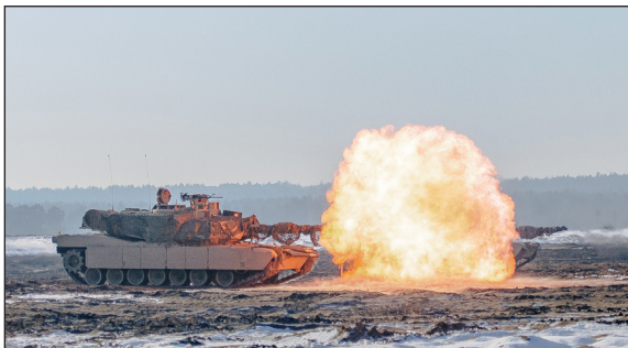
Above A 120 mm round is fired from an M1A2 Abrams Main Battle Tank from 1st Battalion, 68th Armor Regiment, 3rd Armored Brigade Combat Team, 4th Infantry Division, during tank gunnery qualification at Presidential Range in Swiestozow, Poland, January 27, 2017.