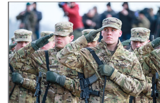
24th Press Camp Headquarters Soldiers from the 3rd Armored Brigade Combat Team, 4th Infantry Division, march past the reviewing officers during the welcome event for the brigade at Karliki Range, Zagan, Poland, Jan. 30, 2017.