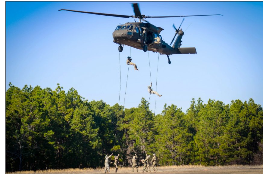
Above Students from the XVIII Airborne Corps DeGlopper Air Assault School rappel from a UH-60 Black Hawk helicopter at Fort Bragg, N.C., Jan. 26, 2017.