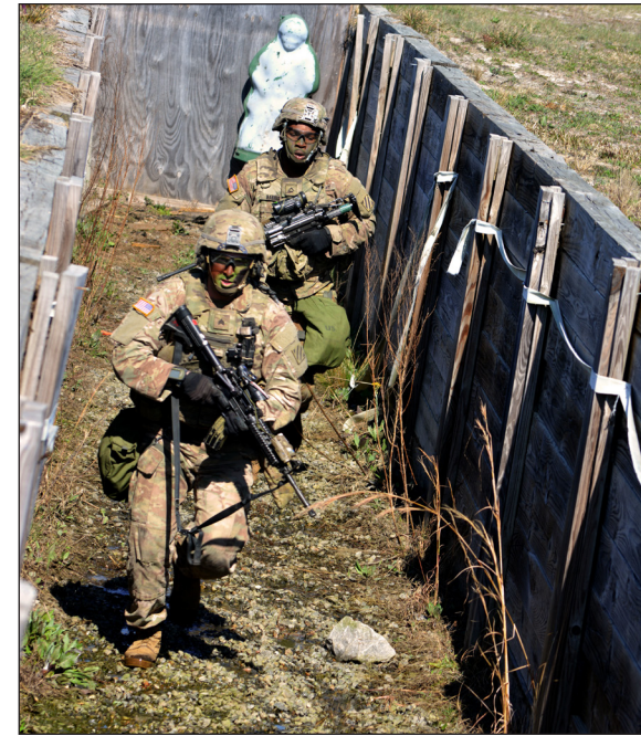
Right Soldiers from 1st Battalion, 64th Armor Regiment, 1st Armored Brigade Combat Team, 3rd Infantry Division, clear a trench line during a Combined Arms Live-Fire Exercise at Fort Stewart, Georgia Feb. 7, 2017.