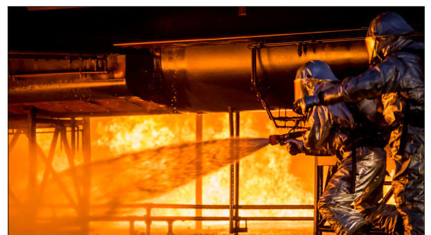
Marines push back a jet fuel fire during a training exercise aboard Marine Corps Air Station Beaufort, Dec. 13. The Marines with Expeditionary Firefighting Rescue conducted the training to prepare for and hone skills necessary to face real life scenarios. The training also served as an opportunity to strengthen camaraderie and enhance trust among the unit members. The Marines are with EFR, Headquarters and Headquarters Squadron.