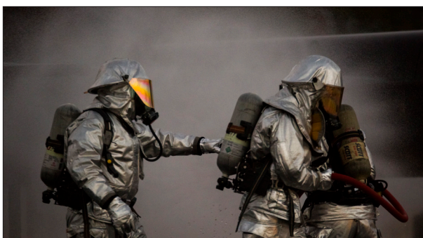
Marines put out a jet fuel fire during a training exercise aboard Marine Corps Air Station Beaufort, Dec. 13. The Marines with Expeditionary Firefighting Rescue conducted the training to prepare for and hone skills necessary to face real life scenarios. The training also served as an opportunity to strengthen camaraderie and enhance trust among the unit members. The Marines are with EFR, Headquarters and Headquarters Squadron.