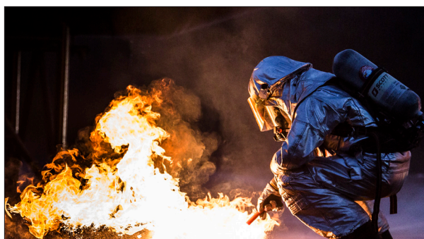
A Marine ignites jet fuel with a flare during a training exercise aboard Marine Corps Air Station Beaufort, Dec. 13. The Marines with Expeditionary Firefighting Rescue conducted the training to prepare for and hone skills necessary to face real life scenarios. The training also served as an opportunity to strengthen camaraderie and enhance trust among the unit members. The Marines are with EFR, Headquarters and Headquarters Squadron.