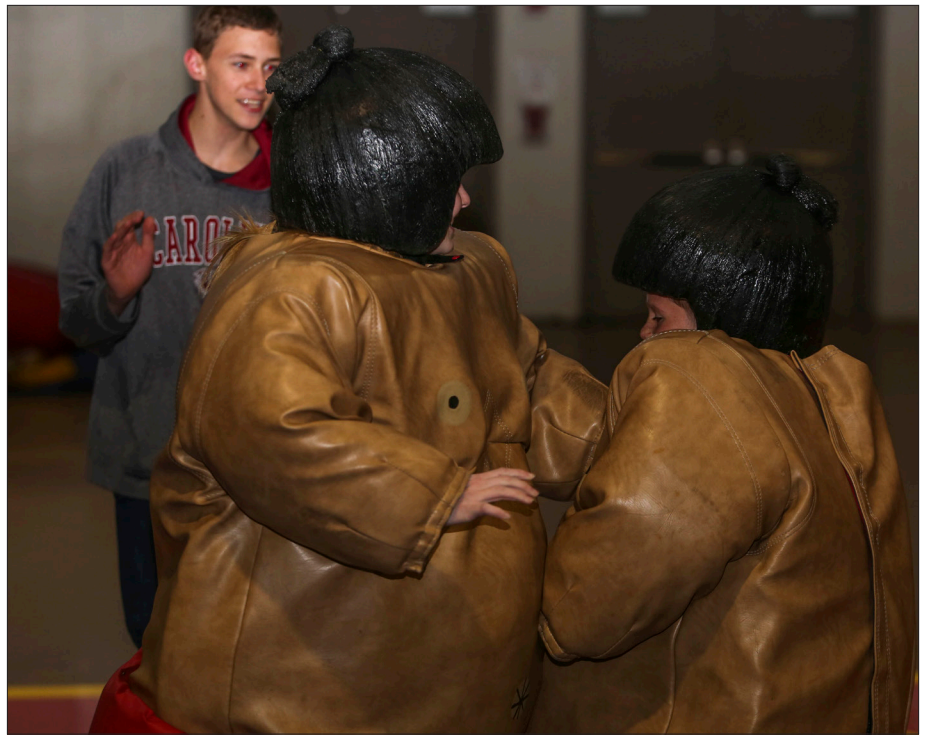
Children wrestle while wearing sumo suits during a holiday party at Marine Corps Recruit Depot, Parris Island, Dec. 10. Headquarters and Headquarters Squadron held the event to celebrate the upcoming holidays, promote camaraderie and unit cohesion among its service members and their families.