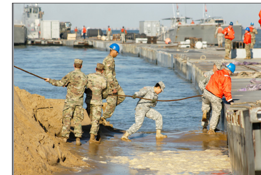
Soldiers assigned to the 331st Transportation Company, 10th Transportation Battalion (Terminal), 7th Transportation Brigade (Expeditionary), attach a tethering line to a floating pier, Dec. 2, 2016, near Ft. Story, Va.