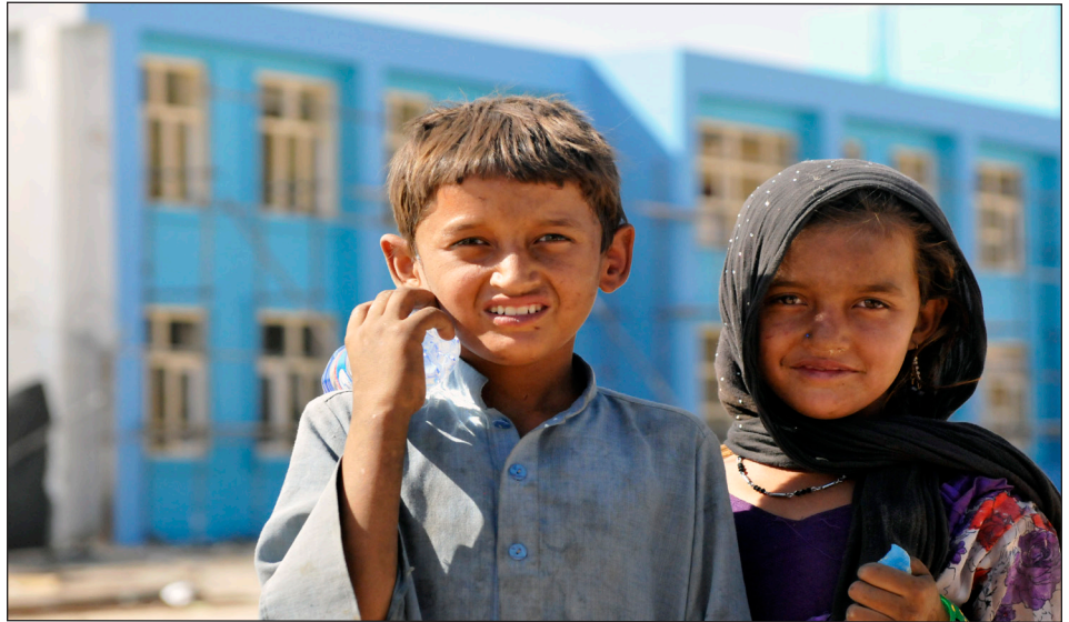
Local children in front of the Sayed Pacha School outside Kanahar Air Field