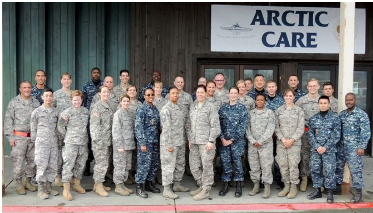
Members of the Naval Ophthalmic Support and Training Activity active duty personnel along with Navy and Army Reservist personnel provided essential eye care during the 2016 exercise known as Arctic Care, Kodiak, Alaska.

size and color. The patient is given the opportunity to select a frame when they are examined. Once the lens is cut to the correct shape and size, they are inserted into the frame and inspected for quality by an optician using a lens analyzer. The lens analyzer is an electronic machine that reads the power of the glasses and other specification related to the patient. Once the glasses are found to be optically sound, they are ready to be dispensed to the patient. This entire process, from the time the patient receives the initial eye exam until the time the patient has a pair of glasses in-hand varies, but the maximum length does not exceed three days.