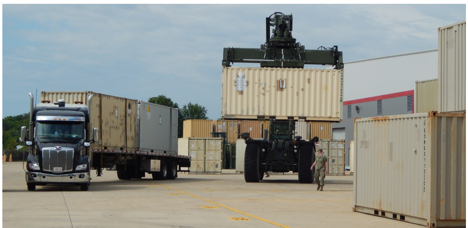
Staff members from Navy Cargo Handling Battalion (NCHB)–1 provide ground guidance for the container lift. NCHB also provided drivers and tracking staff for loading the Expeditionary Medical Facility gear.