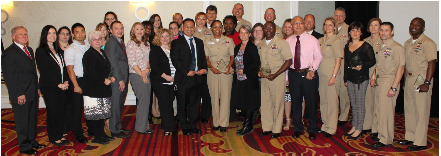
The U.S. Navy Bureau of Medicine and Surgery recognized military medical logistician and comptroller professionals during its Navy Medicine Business Operations Training Symposium, in Falls Church, Virginia, 3 May. Twenty-two professionals were acknowledged for their contributions to Navy Medicine.