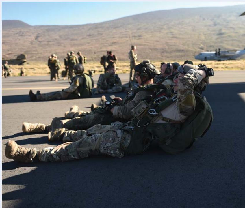
Special Tactics Airmen with the 320th Special Tactics Squadron (STS) standby to board an MC-130J Commando II to perform a military freefall operation with special operations assets and conventional forces from all four branches of the U.S. Armed Forces in a multi-aircraft, joint airborne operation as part of Rim of the Pacific 2016 to strengthen their relationships and interoperability with their partners, Pohakuloa Training Area, Hawaii, July 14. The 320th STS is participating in Rim of the Pacific 2016 with III Marine Expeditionary Force in order to practice their unique skills and strengthen their partnership to respond to crises quickly.

"What airborne operations provide aside from non-standard infiltration proficiency is the opportunity to work