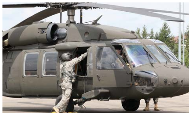
An Army National Guard Helicopter Taskforce Blackhawk crew chief helps secure his UH-60L at Illesheim Airfield, Germany July 11. The task force is comprised of four UH-60L Black Hawks and Soldiers from the Colorado, Utah and Kansas Army National Guard.

As a direct support aviation task unit, the helicopter task force will conduct multi-functional aviation support to SOCEUR by providing air movement, static and military freefall support, and fast-rope insertion and