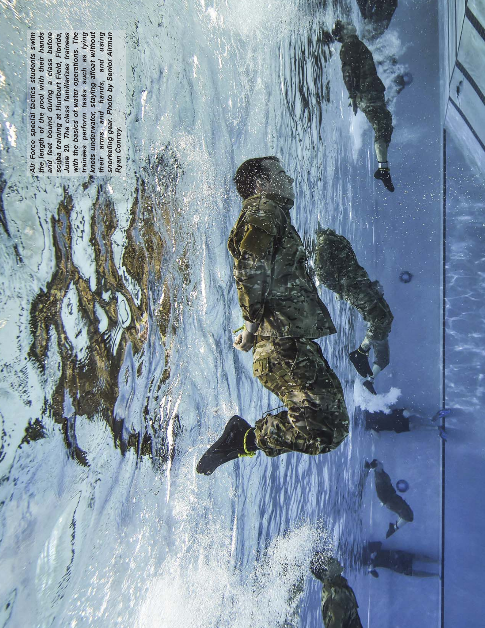
Air Force special tactics students swim the length of the pool with their hands and feet bound during a class before scuba training at Hurlburt Field, Florida, June 29. The class familiarizes trainees with the basics of water operations. The trainees perform tasks such as tying knots underwater, staying afloat without their arms and hands, and using snorkeling gear.