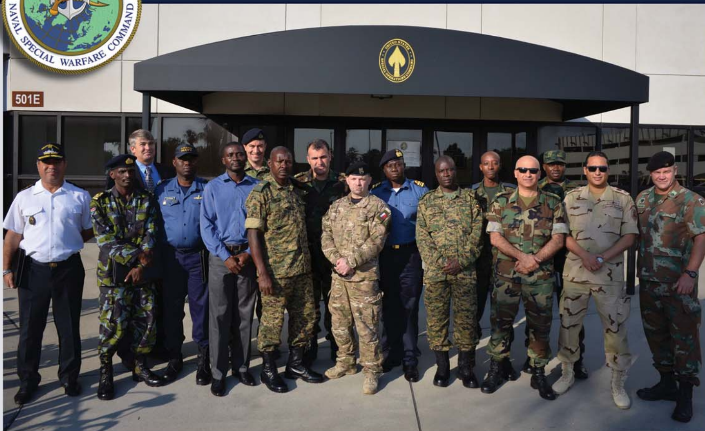
Naval Small Craft Instruction and Technical Training School Strategic Level Small Craft Combating Terrorism Course (SLC) participants assemble in front of United States Special Operations Command April 29, during a visit as part of the SLC course. The 15 SLC participants represented 13 separate partner nations.