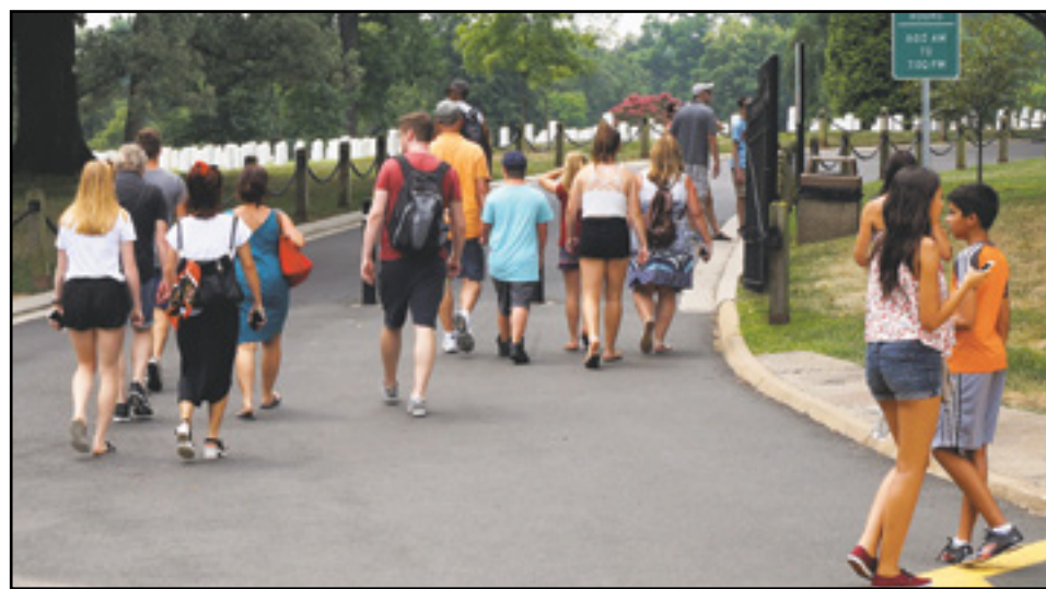
Visitors endure temperatures topping 98 degrees Fahrenheit during a tour of Arlington National Cemetery July 26. Members of the Joint Base Myer-Henderson Hall Fire Department, who are also emergency medical technicians (EMTs), have been proactive in mitigating heat casualty ailments by patrolling ANC more often. "Some days we've been called to Arlington National Cemetery five to six times a day," said Capt. William Long, JBM-HH Fire Department.