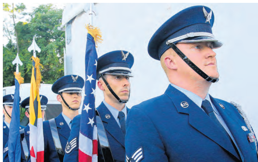
A color guard from the 70th Intelligence, Surveillance and Reconnaissance Wing prepares to enter the main stage.