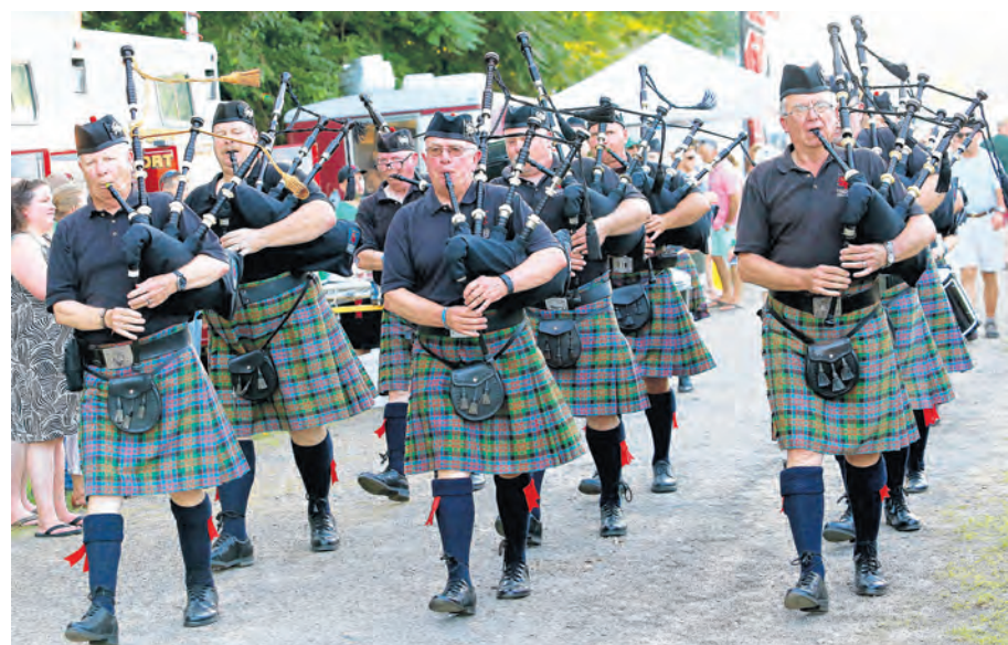
The Pipe and Drum Corps makes its way to the main stage during the two-day Annapolis Irish Festival.