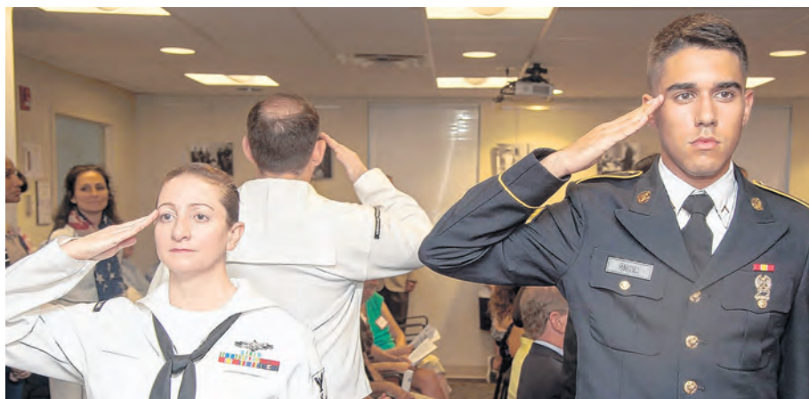
A special Honor Salute is rendered by service members from Fort Meade and the U.S. Naval Academy to family members at the Tribute Wall unveiling at the Hospice of the Chesapeake.

“united front” among the event’s participants.