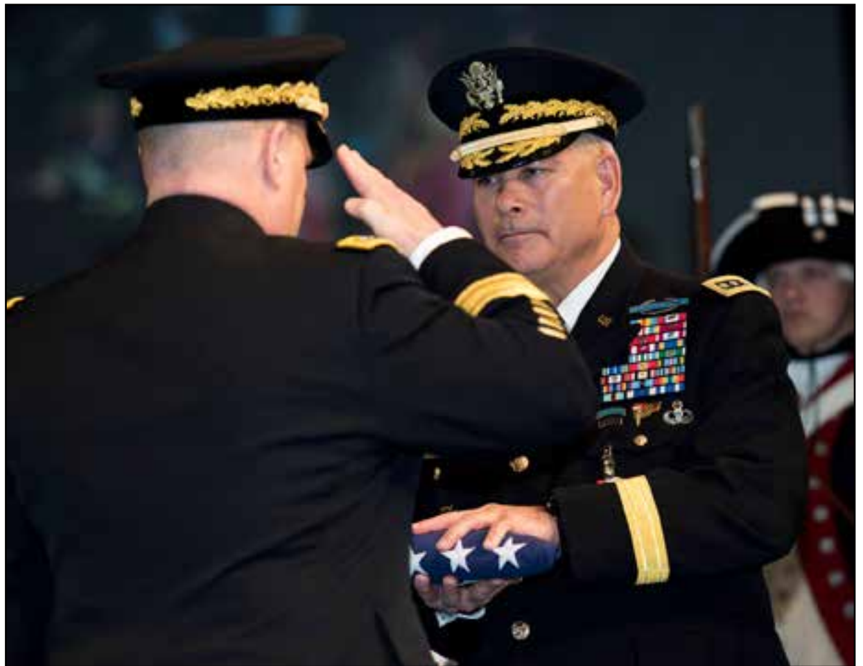
U.S. Army Gen. John F. Campbell receives the American flag and a salute from Army Chief of Staff Gen. Mark A. Milley during a retirement ceremony for Campbell inside Conny Hall April 8 on the Fort Myer portion of Joint Base Myer-Henderson Hall. Campbell, a former Army vice chief of staff, retired after 37 years of military service. He is the second Army four-star general to retire in less than a week – former U.S. Central Command Commander Gen. Lloyd Austin III retired in a separate ceremony at Fort Myer April 5.

Where Campbell refused to boast about personal accomplishments, Gen. Mark A. Milley, chief of staff of the Army, spoke glowingly of Campbell's contributions to the military. He summarized his military style as being "quiet" and "selfless." Campbell's father served