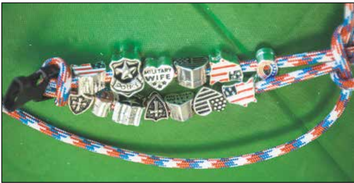
Survivors of fallen service members participated in a variety of arts and crafts April 9 during a one-day seminar on building resiliency through creative arts and spirituality, including building paracord bracelets such as this one.