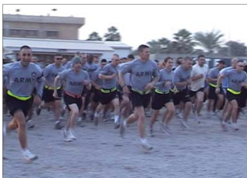
More than 200 runners came out Nov. 17 for the Truscott Trot 5K fun-run.

Lucian King Truscott, Jr., was one of seven generals who commanded the 3rd Infantry Division during World War II.