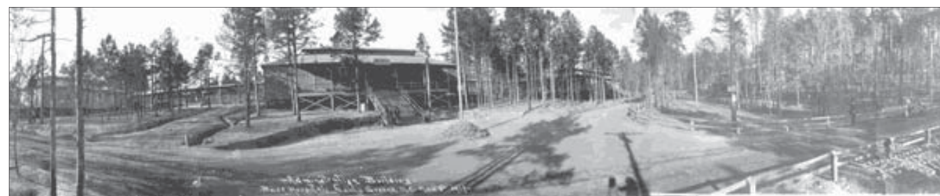
Camp Greene, N.C., where the 3rd Division conducted its first training in 1917.

From the very beginning, the 3rd Division learned to deal with problems and hardship. Camp Greene (named for Revolutionary War General Nathaniel Greene) provided both. Secretary of War Newton Baker had decided that, as winters in the south were not severe, camps there did not need permanent buildings. So Camp Greene had been built as a tent city to save money.