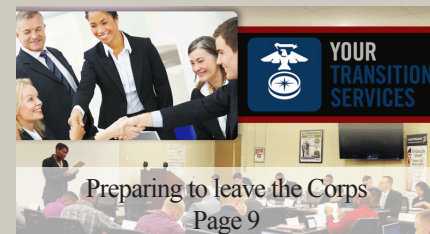
Preparing to leave the Corps Page 9