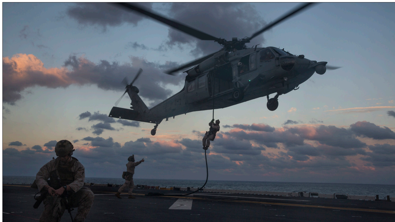
Marines with the Maritime Raid Force, 24th Marine Expeditionary Unit, load into an MH-60S Seahawk helicopter on the flight deck of the USS Iwo Jima, Oct. 31. The MRF conducted fast-rope training using aviation support from Sea Combat Squadron 28. The 24th MEU is participating in exercise Bold Alligator, an exercise intended to improve Navy and Marine Corps amphibious core competencies.

The SMP hosts events like this to allow Marines access to the surrounding areas of Twentynine Palms.