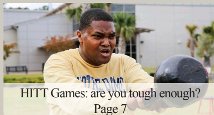
HITT Games: are you tough enough? Page 7