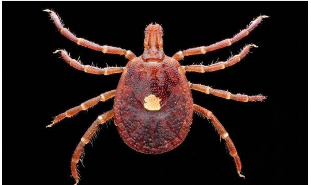
The lone star tick is found in many communities in the United States. One of the first things personnel can do to prevent a tick bite is to recognize tick habitats and avoid them.

can also make simple changes to reduce the number of mosquitoes and ticks around their yards. A female mosquito prefers to lay her eggs in standing water, and under ideal weather conditions, it can take less than a week for her eggs to hatch and develop into adults. Break this weekly breeding cycle by removing the standing water from your yard. Empty any water accumulating in toys, lawn furniture, clogged gutters, tarp-covered vehicles and other artificial containers. Water containers like pet bowls and bird baths can be emptied and refilled weekly to get rid of mosquitoes. Ticks are most common in tall grass and shrubs and are moved around by animals. Keep your yard free of trash and debris, mow lawns, trim overhanging trees and shrubs and avoid feeding or attracting feral and wild animals into your yard.