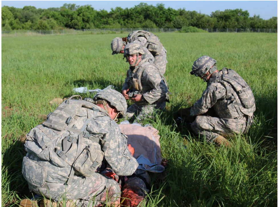
Medical Soldiers from 2nd ABCT, 1st Inf. Div., assess simulated casualties during Brigade Combat Team Trauma Training June 19 at the Medical Simulations Training Center on Fort Riley, Kansas. The BCT3 had 192 Soldiers operating in four-man teams culminating five days of class room and situational training exercises.