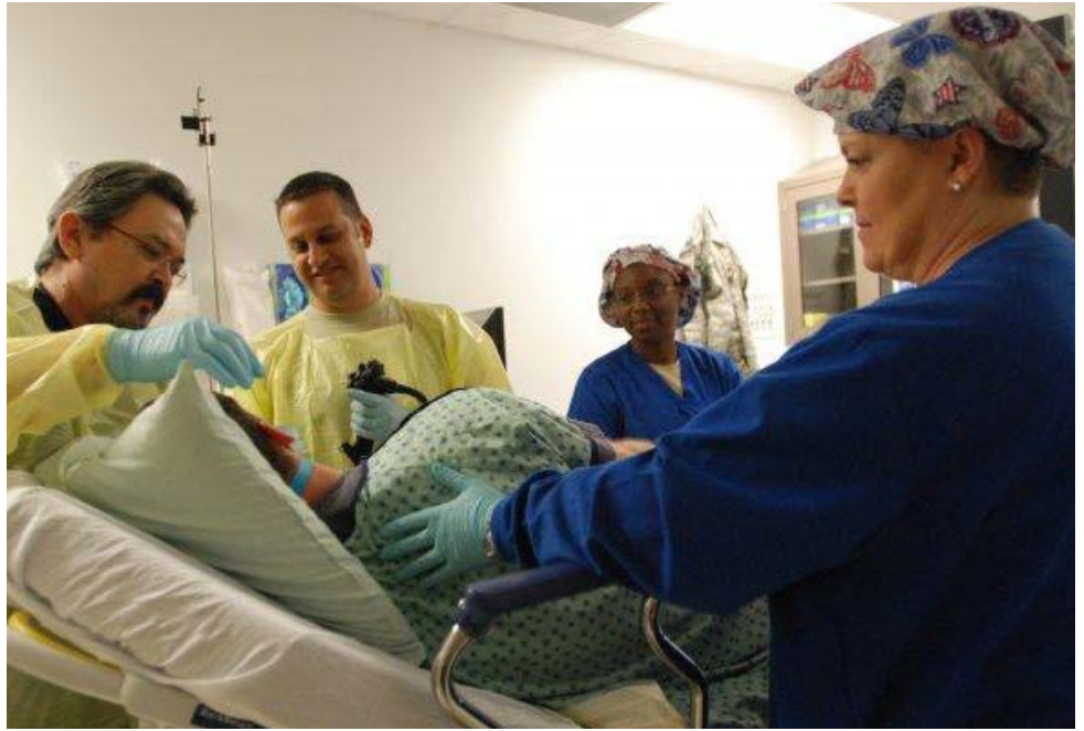
Members of the Womack Army Medical Center's Gastrointestinal Endoscopy unit perform an esophagogastroduodenoscopy, an upper endoscopy better known as an EGD, at Womack Army Medical Center, July 1, 2015. The clinic was recently earned recognition status from the American Society for Gastrointestinal Endoscopy for their commitment to patient safety and quality in endoscopy.

chief, Gastroenterology Service, WAMC, spearheaded the process to achieve ASGE recognition. He said that going through the evaluation has helped improve communication among all members of the team.