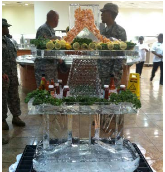
Dining Facilities (DFACs) went above and beyond for decoration and food presentation categories, K-Quad produced an ice sculpture for condiments and sauces during the first, annual Soldier Athlete Warrior (SAW) Fueling Competition.

products during this competition and demonstrated pride in serving their customers quality food. Results are still being tabulated and the winner will be announced in the near future by the Hawaii Garrison Installation Food Program Manager Office. What does this mean for diners? Eventually, this annual competition should result in improved food choices at Hawaii garrison DFACs. Comment cards are always available in DFACs and diners should use them to provide constructive feedback year round (not just during the SAW competition). The only way to be heard and see change is to voice your opinion.