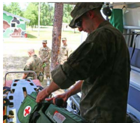
A Polish army medic packs up equipment inside an Iveco "S" military ambulance after demonstrating medical evacuation procedures for U.S. Army medics during their second day of joint training July 3, at Nowa Deba Training Area in southern Poland. Having just arrived for a three-month training rotation, these Soldiers from Poland's 6th Airborne Brigade and the U.S. Army's P Troop, 4th Squadron, 2nd Stryker Cavalry Regiment spent much of the day getting acquainted and learning about their different medical equipment and procedures. The Soldiers are part of Atlantic Resolve, an ongoing multinational partnership focused on joint training and security cooperation between NATO allies.