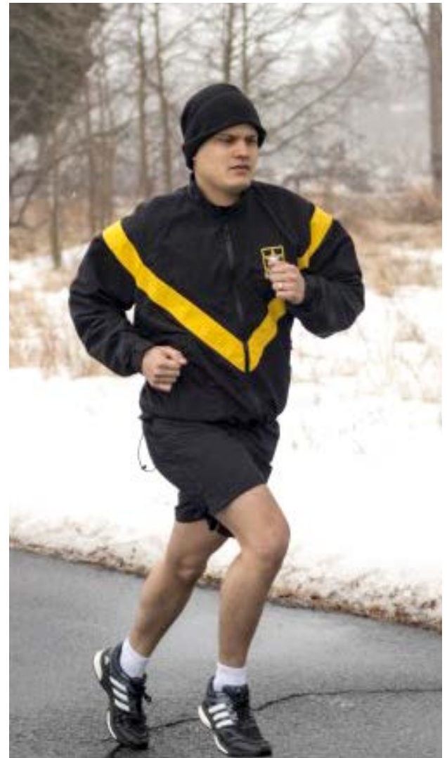
Small bouts of exercise in your day may allow you to take advantage of the small breaks of time in your daily schedule.

Any exercise is better than no exercise. Aim for at least 10-minute bouts of exercise spread out throughout the day. Smaller bouts of exercise may be more manageable and allow you to take advantage of the small breaks of time in your busy schedule.