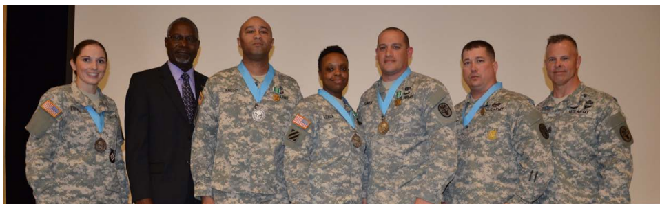
Audie Murphy only lived 46 years but he made a lasting imprint on American history. He was assigned to the 15th Infantry Regiment of the 3rd Infantry Division and fought in North Africa,