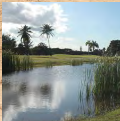
in the heart of San Juan!