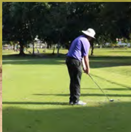
for a game...