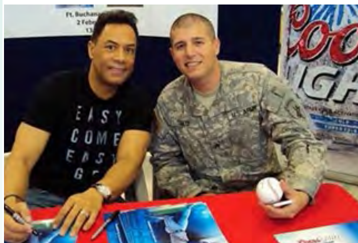
Roberto Alomar, former Major League baseball player, signs autographs at Fort Buchanan's Army and Air Force Exchange Service (AAFES) main lobby on 2 February 2015.