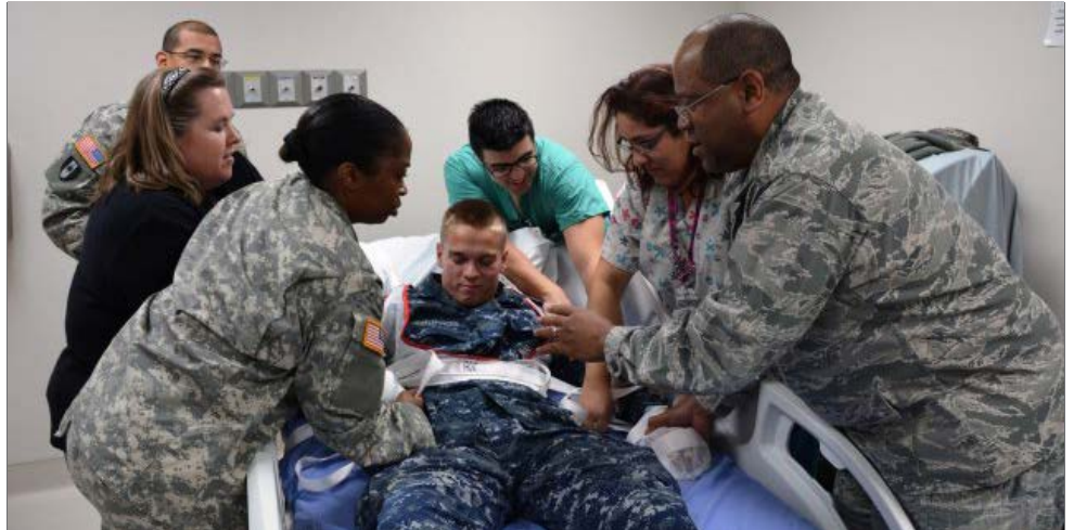
Brooke Army Medical Center nurses complete annual training on patient restraint techniques during Nursing Skills Validation Nov. 19 at San Antonio Military Medical Center.