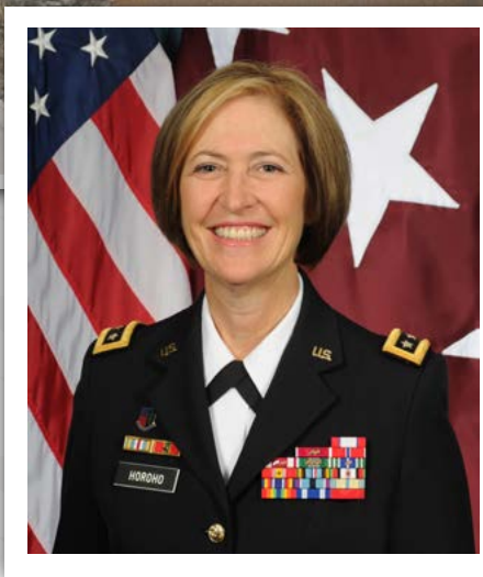
Lt. Gen. Patricia D. Horoho

Lt. Gen. Patricia Horoho, U.S. Army surgeon general and commander, U.S. Army Medical Command, briefs Army Medicine in Europe leaders on becoming a High Reliability Organization (HRO) during a two-day regional summit at Landstuhl Regional Medical Center, Germany. An HRO is an organization that has continuing success in striving to achieve zero harmful events despite operating in a high-risk environment where