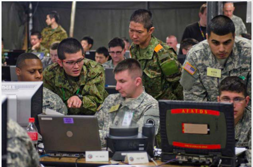
U.S. and Japanese troops interact in the combined operation intelligence center during Yama Sakura 67, a joint, bi-lateral exercise.

Read the full article at: http://www.army.mil/article/139934