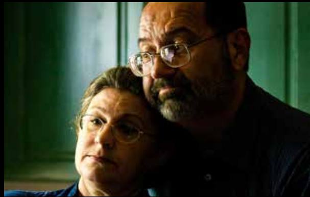
BY TECH SGT. SPINHTHONG

Unit members spent days sifting through debris, searching for the family’s possessions and priceless mementos, such as family photos. One member of Bud’s unit paid for the displaced family’s temporary lodging on base out of his own pocket. Others rented a storage unit and hauled the family’s found belongings there. They handed out temporary furniture, beds, kitchen appliances, dishes and monetary donations. They even organized a 5K run to raise money