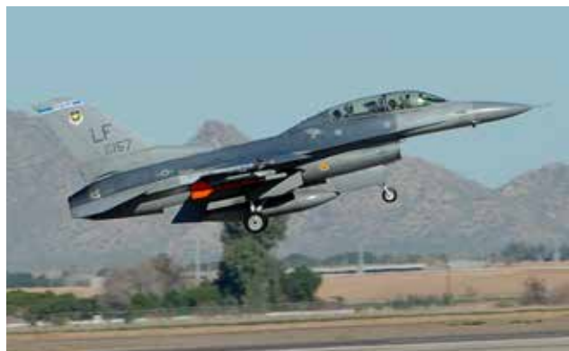
BY AIRMAN 1ST CLASS DEVANTE WILLIAMS

Both pilots safely ejected from the aircraft, suffering nonlife-threatening injuries. There were no fatalities or significant damage to civilian property. The loss of the aircraft cost nearly $8 million, the report said.