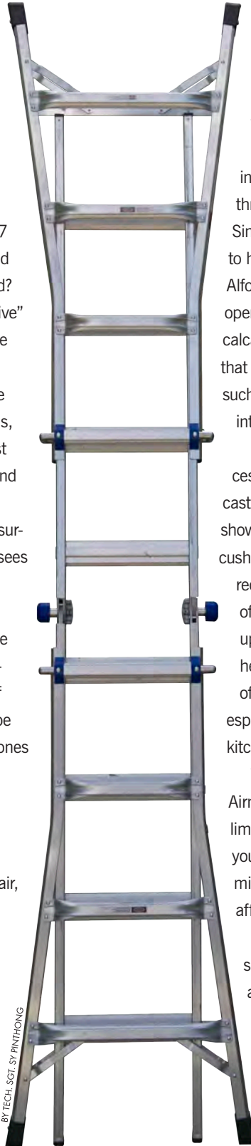
BY TECH. SGT. SY PINHONG

motion that is necessary when both in normal gait and having the foot accommodate uneven surfaces," he said. "If the calcaneus is broken and arthritis develops in that joint, this can cause significant pain or discomfort."