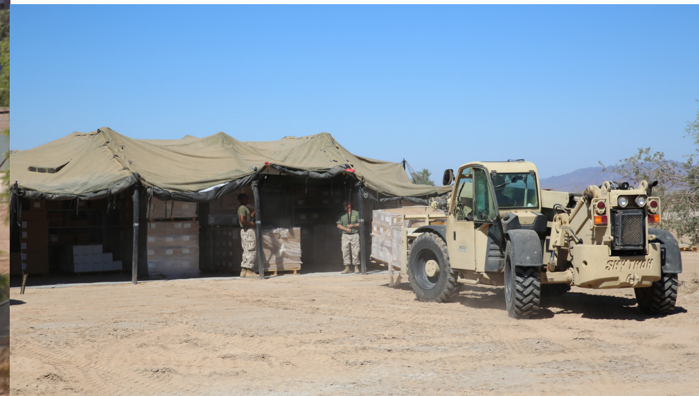
Marines with 1st Supply Battalion, Combat Logistics Regiment 15, 1st Marine Logistics Group, I Marine Expeditionary Force, provide logistical support for the Weapons and Tactics Instructor Course in Yuma, Ariz., Oct. 15, 2014. For more than a month, 1st Supply Bn. provided food, water, and other logistical services to the various forward operating bases where the WTI course Marines were operating.

Thanks to the hard work of the Marines from 1st Supply Bn., the success of the graduate-level WTI course is in hand. Ultimately, this puts 1st MLG's mission of providing support in I MEF's overall mission into practice, assisting I MEF in remaining the Marine Corps' globally responsive, expeditionary and fully scalable Marine Air Ground Task Force.