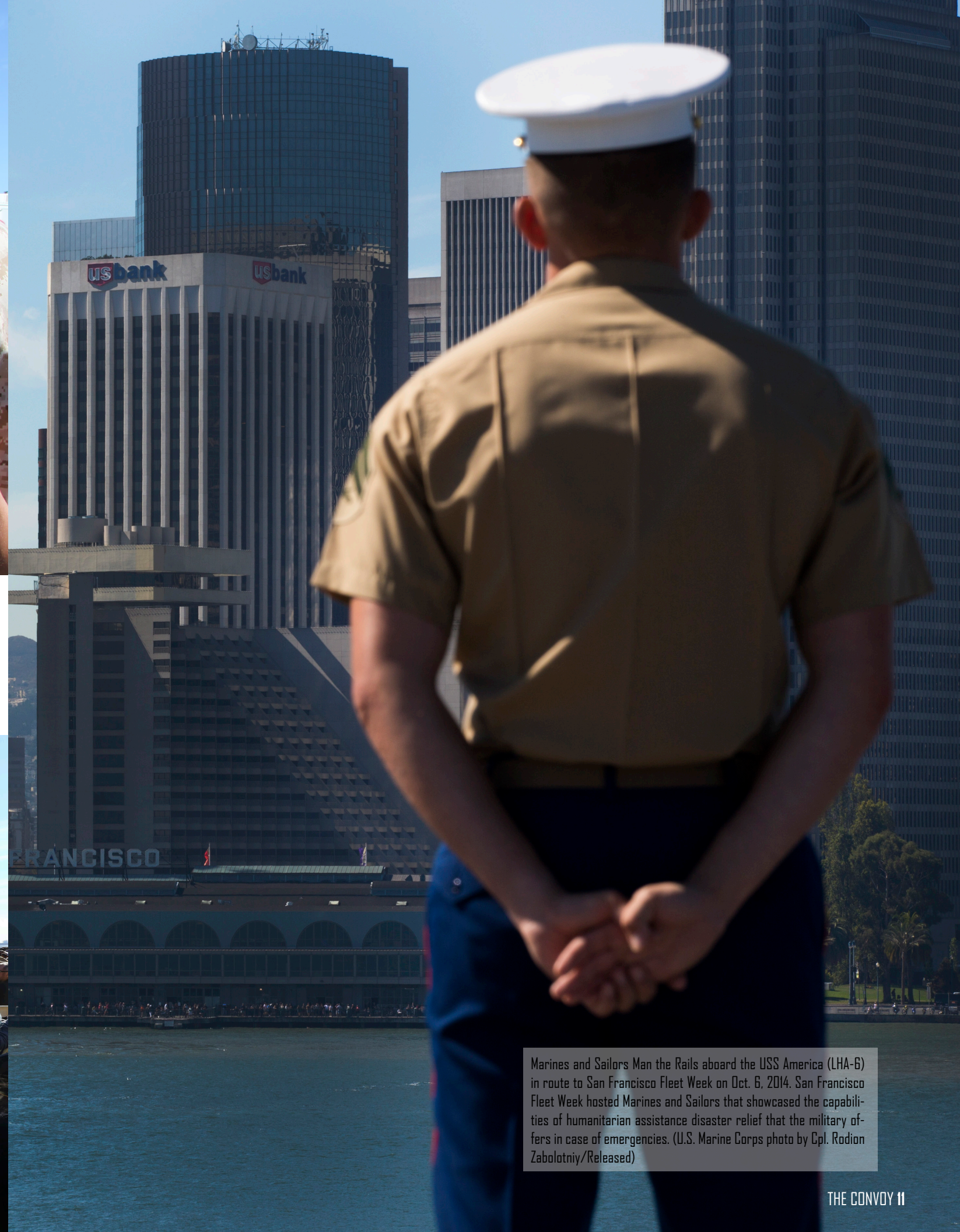
Marines and Sailors Man the Rails aboard the USS America (LHA-6) in route to San Francisco Fleet Week on Oct. 6, 2014. San Francisco Fleet Week hosted Marines and Sailors that showcased the capabilities of humanitarian assistance disaster relief that the military offers in case of emergencies.