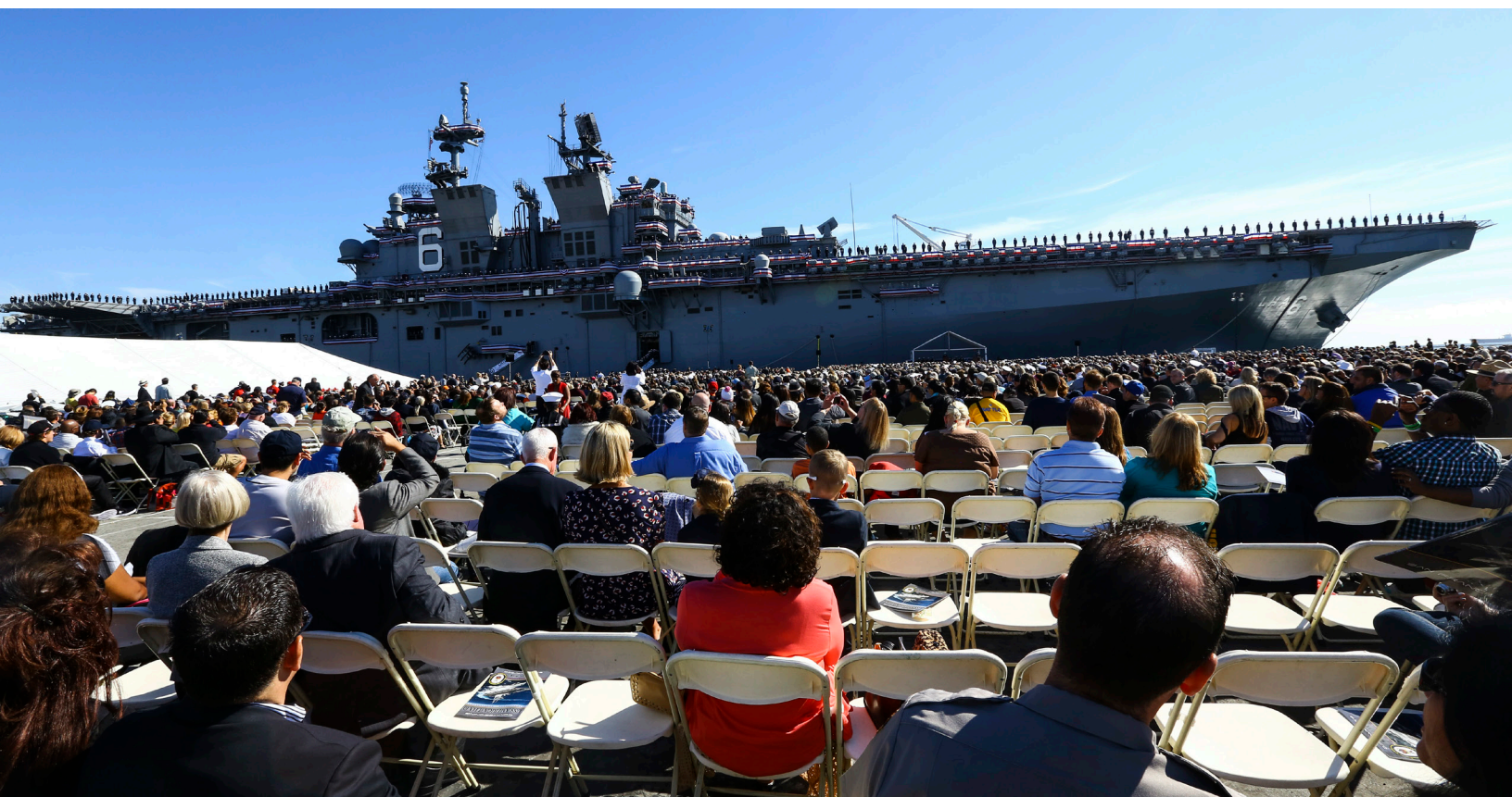
U.S. Marines and sailors man the ship during the Commissioning Ceremony for USS America during San Francisco Fleet Week 2014 on Oct. 11, 2014. San Francisco has hosted fleet week for more than 30 years, and has invited Marines and sailors to showcase a variety of capabilities in response to emerging disasters.