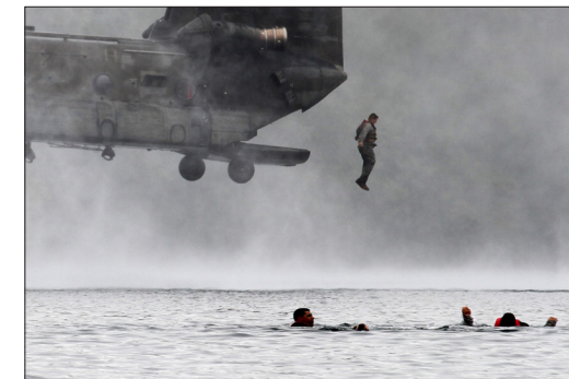
19th Public Affairs Detachment - A Soldier from the 555th Engineer Brigade helocasts from a CH-47 Chinook helicopter during training operations at American Lake on Joint Base Lewis-McChord, Wash., Oct. 9, 2014.