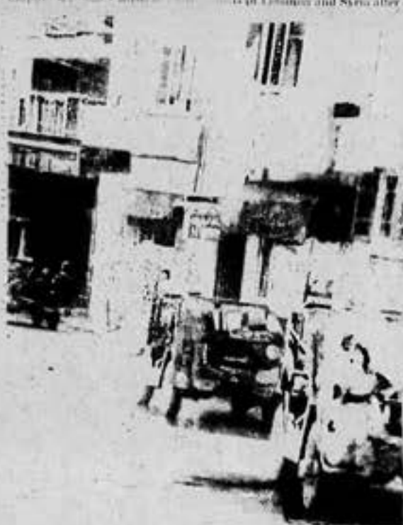
ON THE ROAD — Marines with Battalion Landing Team, 1st Battalion, 8th Marines, patrol the streets of Beirut Aug. 28, 1983 as part of their duties in the Multinational Peacekeeping Force.

"There are many forces at work in this war-torn country. But now there is a cease-fire, and perhaps after these many years, there will be peace in Lebanon."