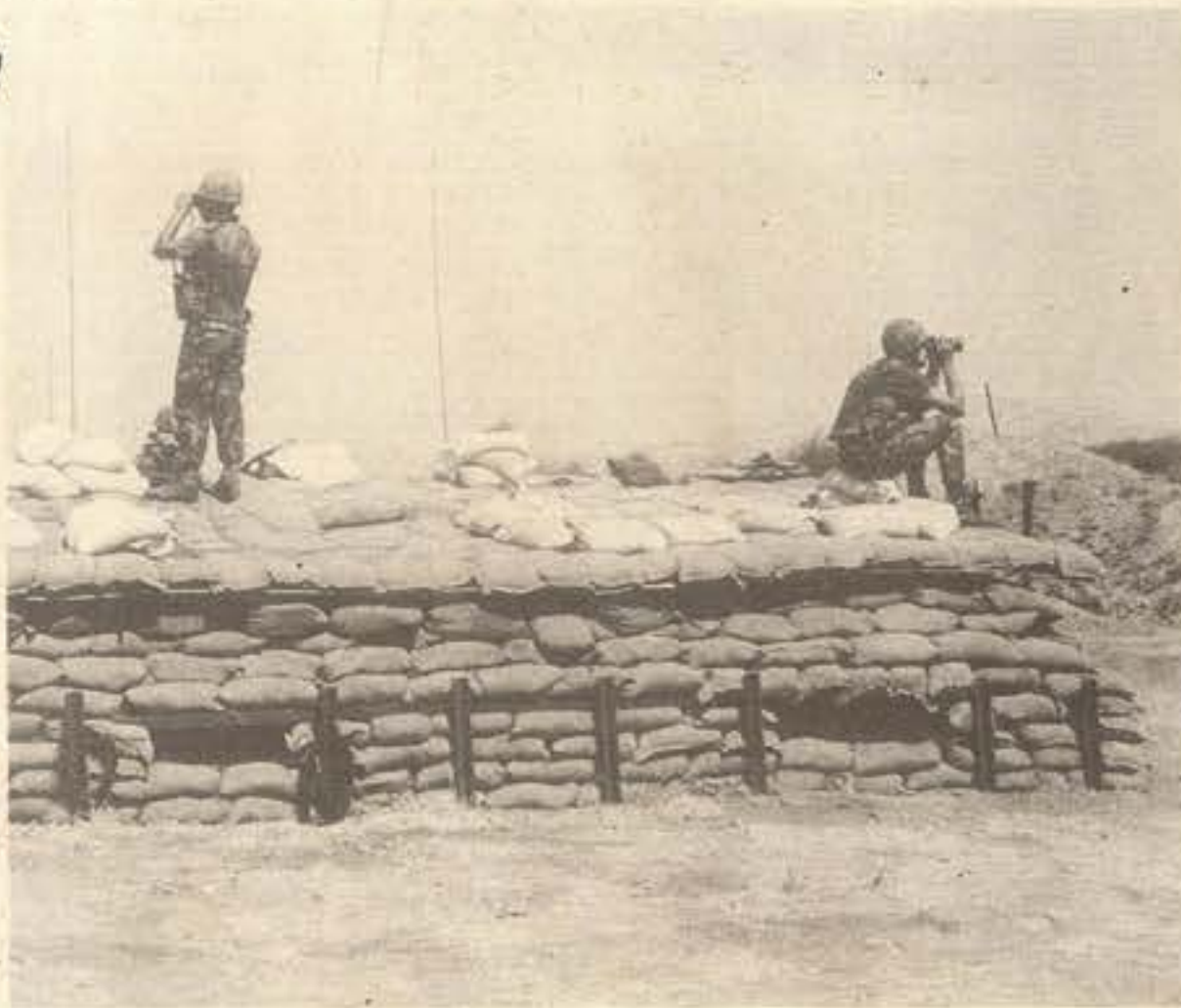
SCANNERS — Marines with "Charlie" Company, Battalion Landing Team, 1st Battalion, 8th Marines scan the surrounding countryside from their position near the end of the Beirut International Airport.