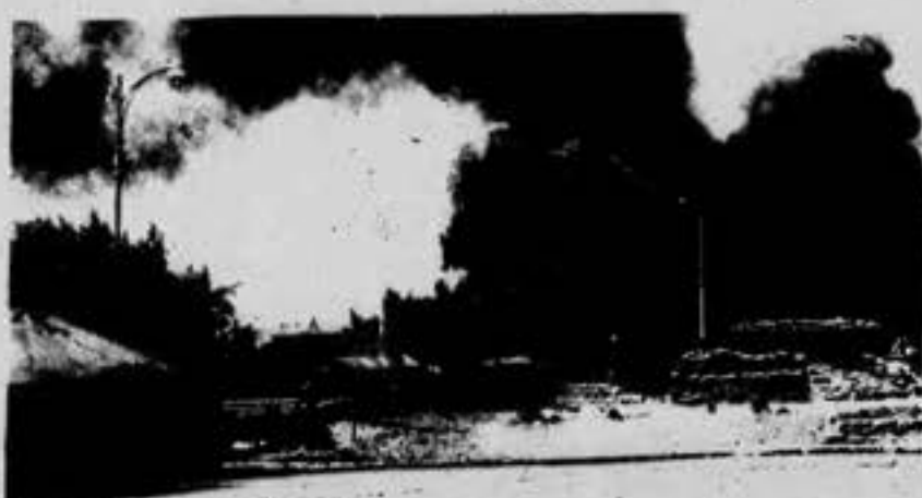
INFERNO — A fire rages after a rocket fired by unknown dissidents exploded behind the Marine compound occupied by the Head-

quarters, Battalion Landing Team, 1st Battalion, 8th Marines Aug. 28, 1983.