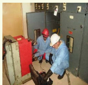
Testing switch gear in main lift pump station at Najaf Water Treatment Plant.

• Overall mechanical and electrical maintenance was successfully completed on two of the main high lift pumps at the Basrah R-Zero Water Treatment Plant;