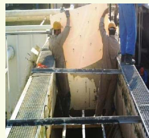
Garma-1 Water Treatment Plant overhaul.

• The Najaf Water Treatment Plant Pump #4 was overhauled, increasing plant performance significantly to 85.2% of design capacity; and