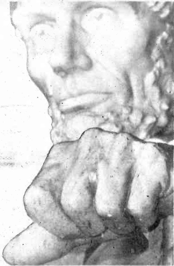
A closeup of French's statue of the 16th President at the Lincoln Memorial reveals the strength of character expressed in Lincoln's furrowed face and clinched left hand.

There can be little doubt that Lincoln's hands were shaped by the hard physical labor of his youth. It is Lincoln, the rail splitter, the farmer, and the working man, that sculptor French has portrayed along with Lincoln, the President.