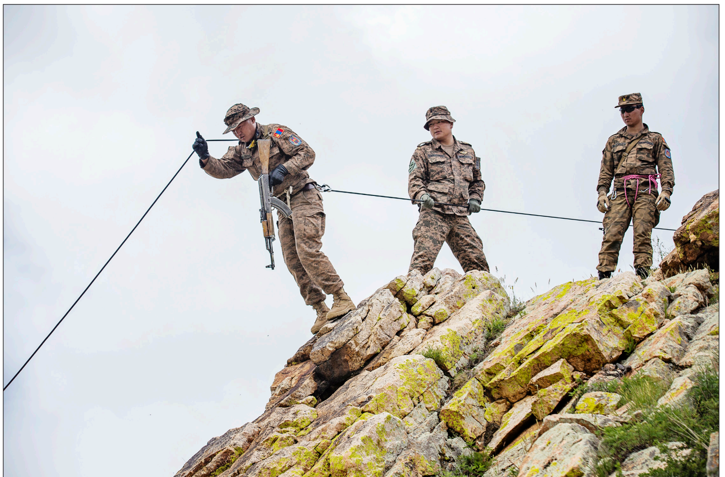
Members of the Mongolian Armed Forces conduct a course in rappelling during Khaan Quest 2014 at Five Hills Training Area, Mongolia, June 21. Khaan Quest is a regularly scheduled, multinational exercise cosponsored by U.S. Army, Pacific, and hosted annually by Mongolian Armed Forces. Khaan Ques is the latest in a continuing series of exercises designed to promote regional peace and security.

On the mountain, they spent two days learning different techniques in rappelling.