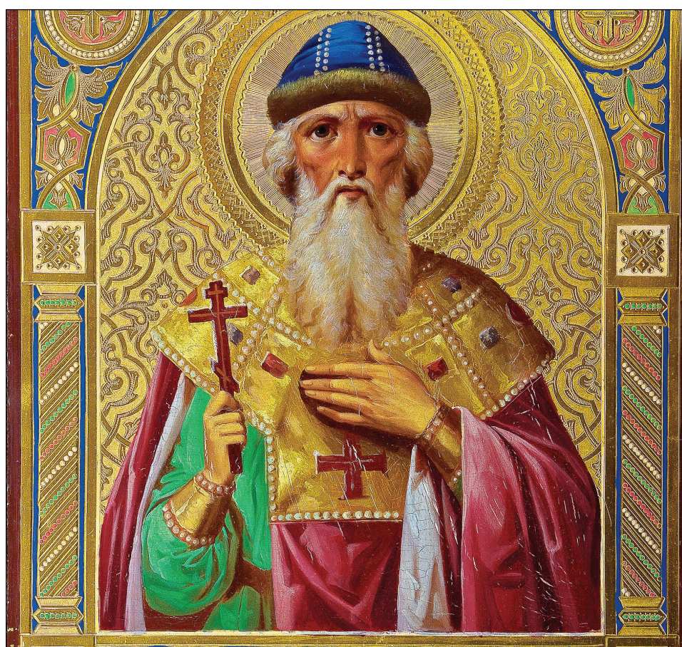
A Russian Orthodox icon of Saint Vladimir.

In the 21st century, people choose their spiritual paths because of what seems to be politically correct, the reports of others, prohibitions or permissions for eating or drinking, or because of relationships.