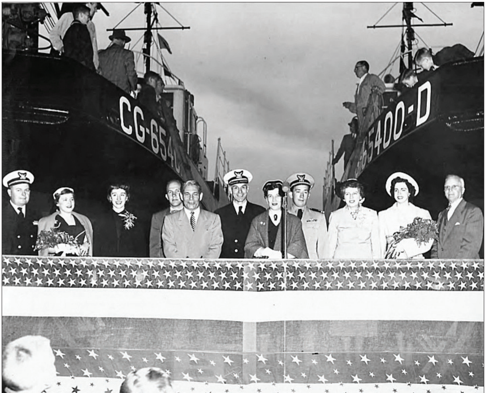
The official party and visitors attend the commissioning of the Coast Guard Cutter Elderberry and its sister cutter, the Bayberry, in Olympia, Wash., June 28, 1954. The Elderberry and Bayberry are 65-foot inland buoy tenders built to maintain aids to navigation. The Elderberry is homeported at Petersburg and manned by an entirely enlisted crew of eight.

That postcard is more than a pretty face. It's a marine highway. Ferries, shipping barges, fishing boats and small cruise ships travel up and down the Wrangell Narrows year-round. Mix together a tight waterway and