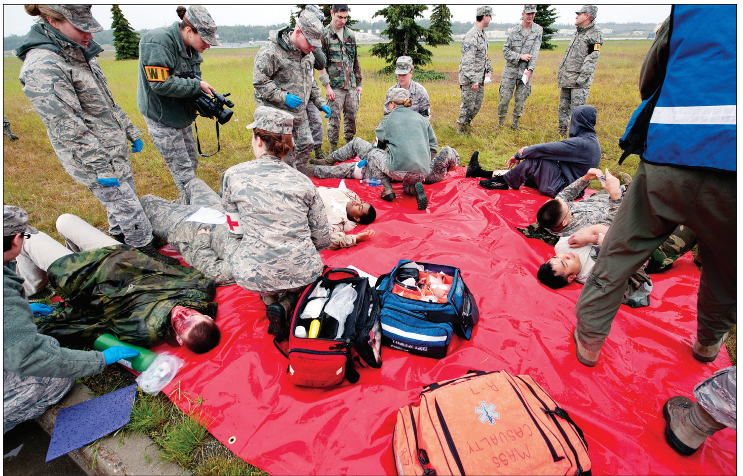
Medical responders tend to simulated victims' wounds during the annual mission-assurance exercise on Joint Base Elmendorf-Richardson June 26. Victims were triaged on different-colored tarps depending on how severe their injuries were and sent to the hospital shortly after for further treatment.

The exercise is a command-directed procedure orchestrated by the base's inspector general.