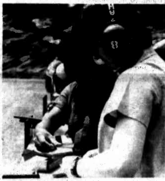
JROTC VIEWS — Junior cadets (far left) scurry out of the amphibious assault vehicle after their initial ride. A coach from the K-Bay Range Complex helps a young woman cadet aim in on the target.