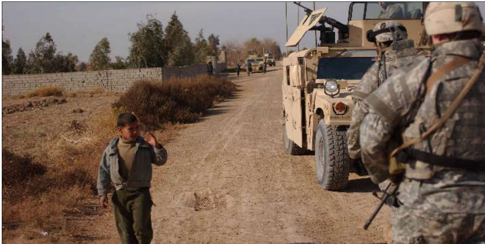
An Iraqi boy gives Soldiers a wave as he passes them on the road.