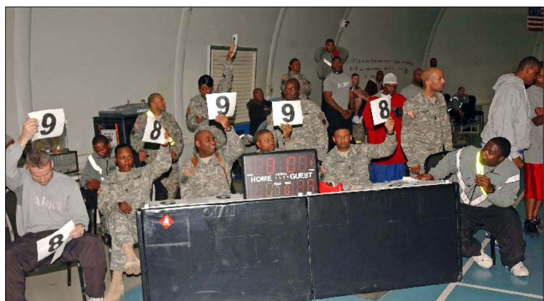
Judges hold up their score cards so the announcer can tally the results after a contestant completes his series of dunks during the all-star weekend slam-dunk competition on Dec. 30 at Sprung Gym.