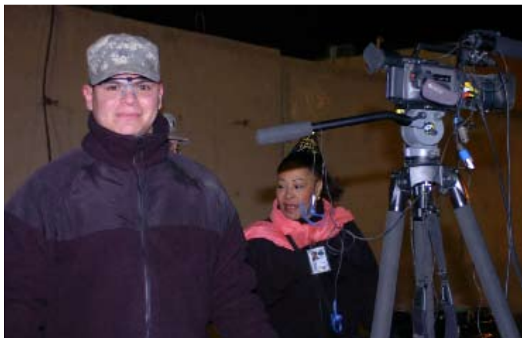
Soldiers stand in line for their chance to be seen around the world during New Year's Eve at Taji.

"It will continue as long as Soldiers are willing and able to tell their stories," he said.