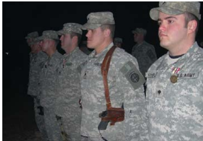
Soldiers of Delta Company, 1-34th Long Range Surveillance Detachment in formation.

The rest of the company was then awarded their medals in the chilly early morning hour.