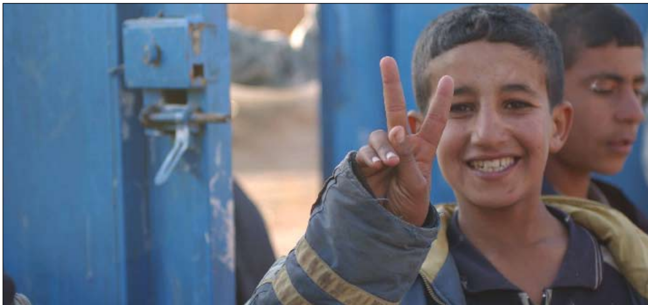
An Iraqi boy shows his delight at a visit from U.S. troops.