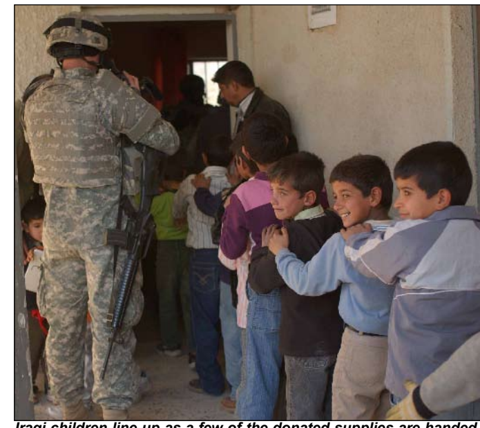
Iraqi children line up as a few of the donated supplies are handed out by school officials.