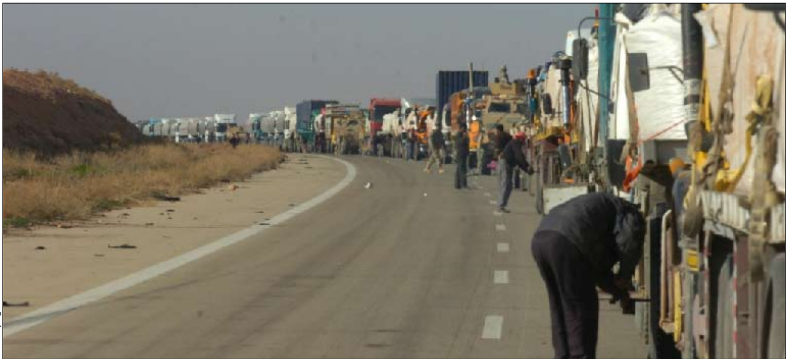
Semi trucks and trailers escorted by Soldiers of Company B, 1st Battalion, 133rd Infantry, 1st Brigade Combat Team, 34th Infantry Division, stretch for several miles during a security halt on Nov. 27 on this road in western Iraq.

"More than likely I was going to get deployed with a Michigan unit," he said. "I knew all these guys and trusted these guys."