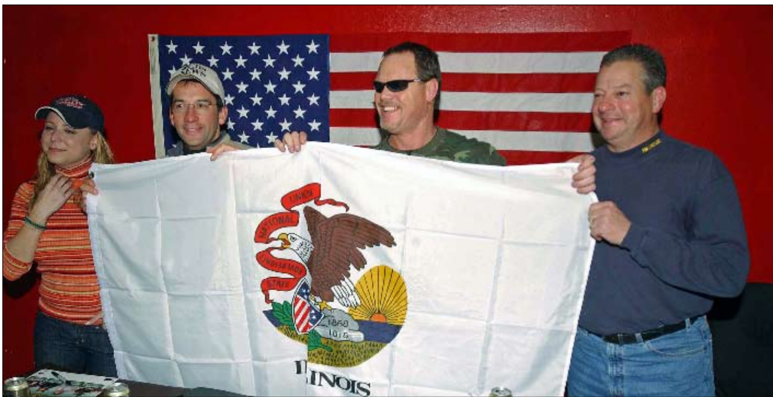
Karri Turner, Dave Price, Jim McMahon and Kevin Butler, present the Illinois State flag to the Illinois Army National Guard' 1744th Transportation Company before the midnight hour.

McMahon has two Super Bowl rings. One ring he earned as the quarterback for the Chicago Bears in 1985 and one when he was a back-up to Brett Favre as part of the Green