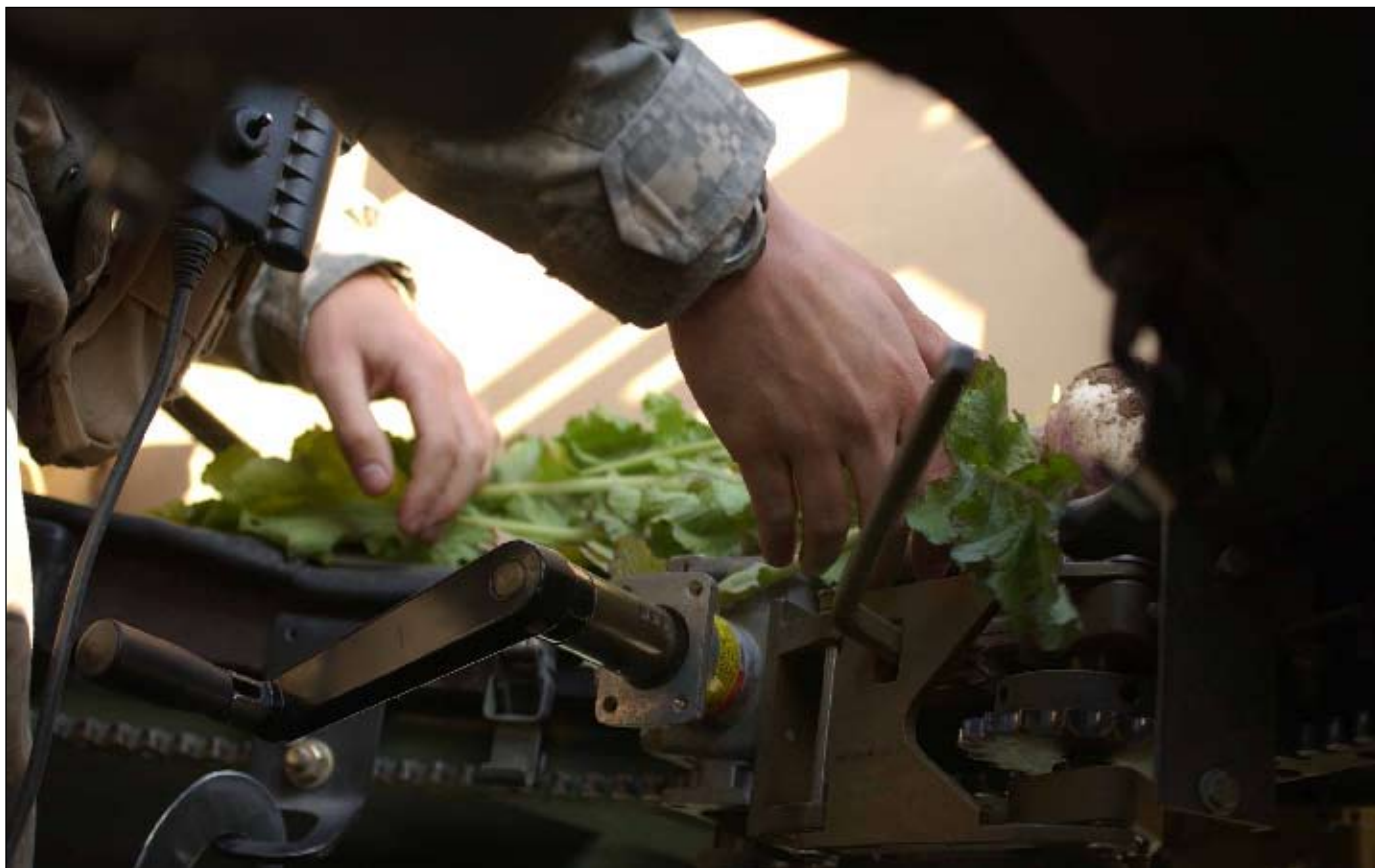
A gunner sets aside some vegetables local Iraqis handed him as he pulled security with his vehicle outside the secondary school in Al Fadoos.