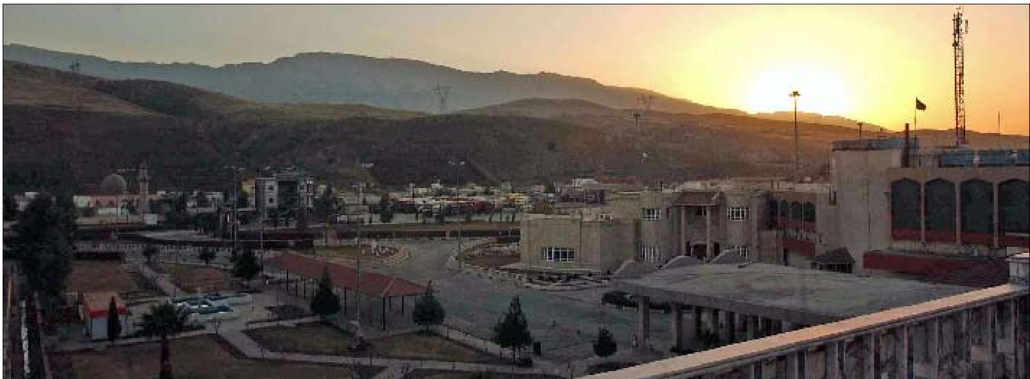
The sun sets over Harbor Gate after a long day of driving, some of the Turkish drivers bring supplies from as far away as Germany.