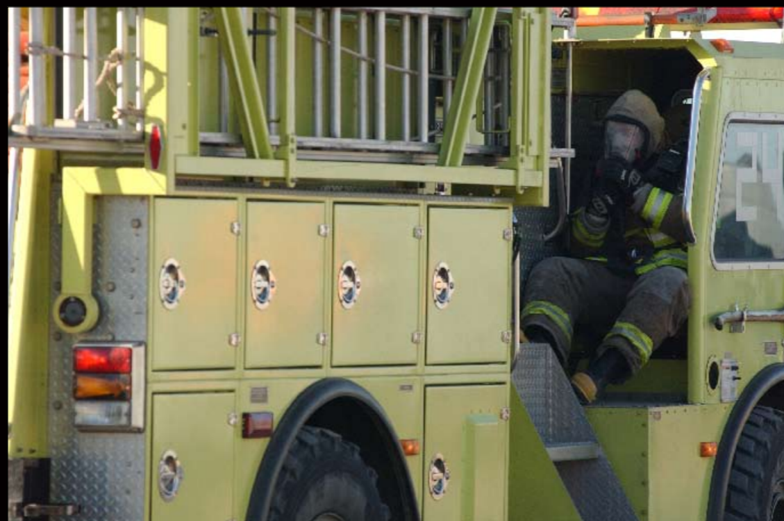
A firefighter prepares his equipment before responding to the fire during the exercise.