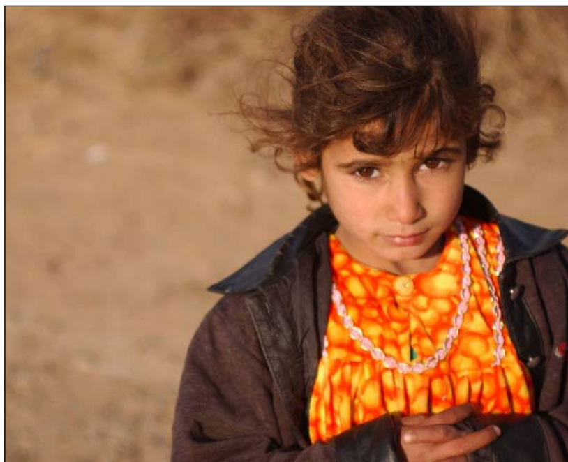
An Iraqi girl stands alone outside the school while others are in class.

"We hope that the new unit does take over our mission," Helfer said. Until that is determined, the 1-167 will hand over their projects to the 2-82 for safe keeping, and to bring as much improvement as possible to the surrounding area until they leave.