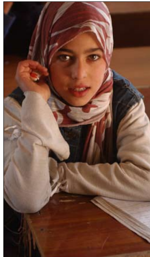
An Iraqi schoolgirl takes pause from her studies to accept some candy handed out by Soldiers in her classroom.