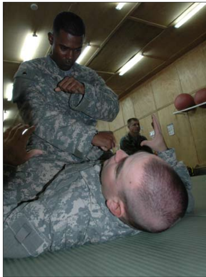
82nd Sustainment Brigade Soldiers go through combatives procedures.

With the high operations tempo, especially in urban terrain, combatives is crucial to the development of our modern fighting force. Gen. George S. Patton once said, “Very few people have ever been killed with the bayonet or saber, but the fear of having their guts explored with cold steel in the hands of battle-maddened men has won many a fight.”