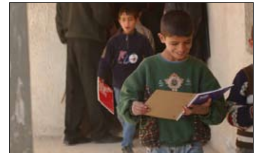
An Iraqi boy walks back to class after receiving a notebook.