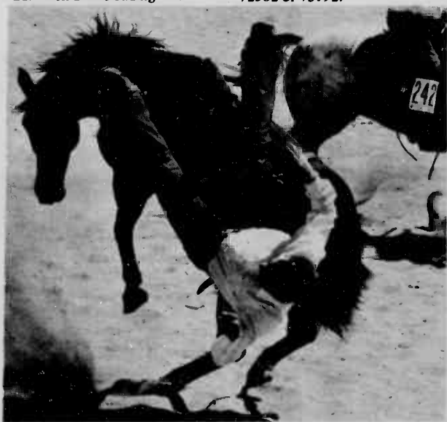
END OF A GOOD THING -This unidentified cowboy walked away from this spill, admittedly a little sore for the experience. Such was the action at the State Finals Rodeo Saturday.