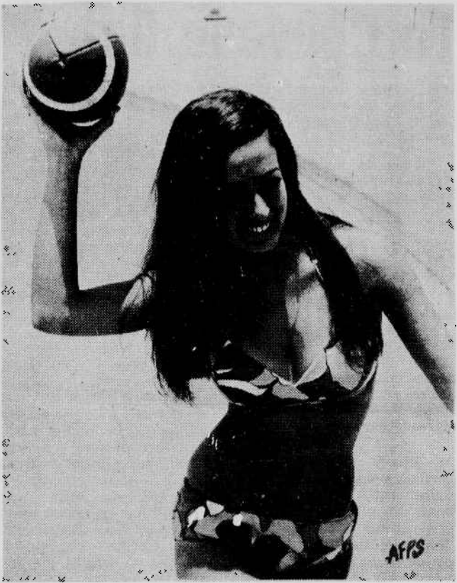
PILE ON-Windy's Miss this week reminds IM football players that piling on is illegal and IM football fans should take heed, too. Use those trash receptacles which are conveniently placed at both football fields. Pile on the garbage-in trash cans, please.