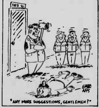
*ANY MORE SUGGESTIONS, GENTLEMEN?*

St. Michael's Catholic Chapel (Bldg. 1090 (Main Exchange)) Phone 73138, 73552, 73182 Masses - Sunday, 8, 9:30 and 11 a.m. Monday through Friday at 11:45 a.m. Holy Days to be announced. Confessions - One-half hour before all Masses Baptisms of Infants - First Sunday of the month, after 9:30 a.m. Mass. See Chaplain one week in advance. Adult Choir - Wednesday at 7:45 p.m. (for 9:30 a.m. Mass); Thursday at 5 p.m. (for 11 a.m. Mass). Christian Doctrine Classes (CCD) - During the school year, grades 1-6, Mondays at 2:30 p.m. Grades 7-8, Saturdays at 10 a.m. Grades 9-12,