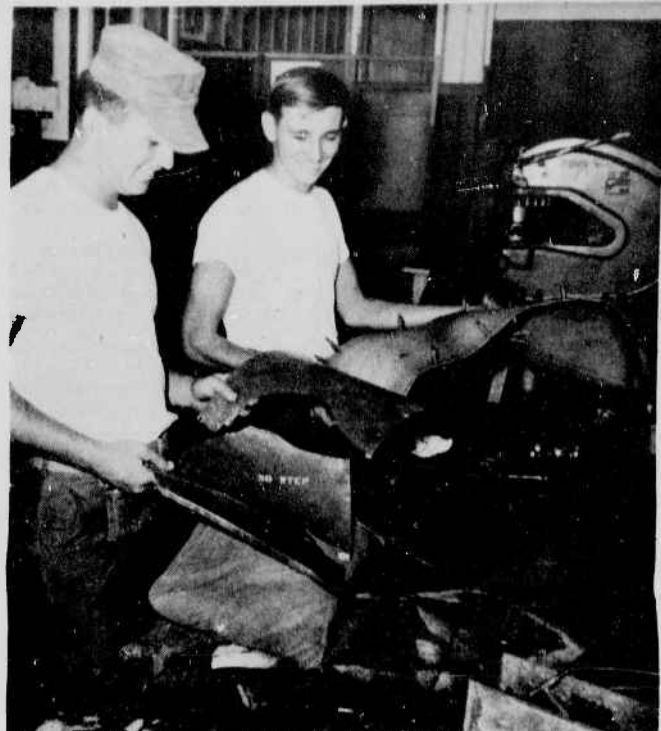
THE CURVES ARE HARDEST TO REPRODUCE. . . Two Marine metal workers smile with satisfaction, as they have reconstructed from scratch the external panel from a Marine Helicopter. The curves are the hardest to make fit, and inaccurately reproduced parts won't fit the aircraft.

Other sections of Airframes include the tire section, which