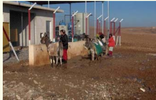
Iraqis living in remote areas use donkeys and buckets to transport water to their homes. Newly constructed rural water facilities throughout the country now provide safe, potable water to Iraqis in isolated communities that do not have access to water purification plants and pipe systems.

These projects will serve as a foundation for the continued provision of potable water to all Iraqis by improving the availability, quality, and level of water and sanitary sewer services in Iraq.