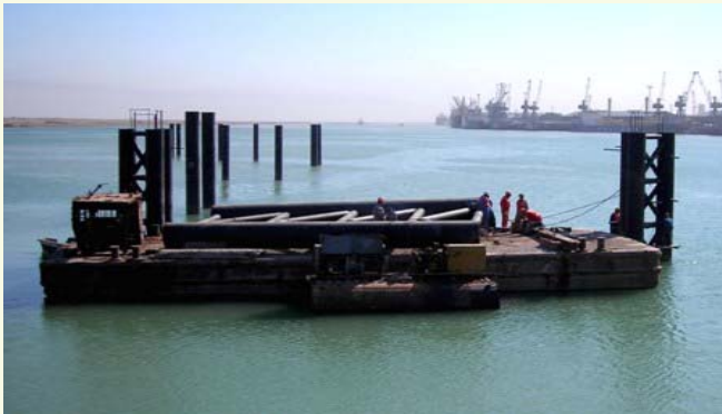
Umm Qsar will have a second roll-on and roll-off cargo pier. Here Iraqi construction workers prepare a metal pier pylon for installation.