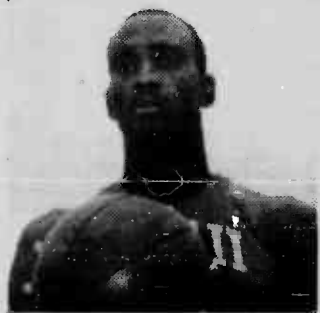
Know Your 'Necks