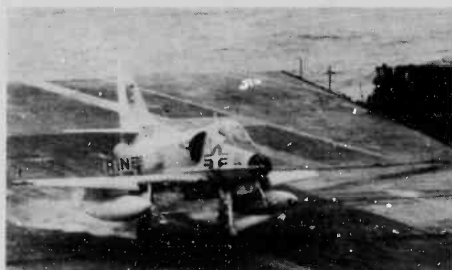
"BLACKSHEEP" LANDING — An A4C "Skyhawk" jet attack bomber piloted by a VMA-214 pilot makes an arrested landing during carrier qualifications aboard the USS Kearsarge (CVS-33). The "Blacksheep" pilots, who boarded the carrier Monday, returned to the Air Station Tuesday, upon completion of the qualifications.

the Group accompanied VMA-214 aboard the Kearsarge and participated in the carrier qualifications.