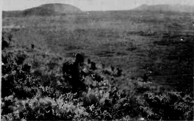
IN THE ASSAULT — Assault troops found the enemy to be fascinating actors when engaged on the many puus of Pohakuloa. The aggressors "died in position" or were "shot down" attempting to evade capture.