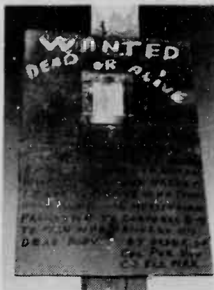
WANTED — This sign, one of many found at aggressor positions, offers a promotion, or "Basket" leave to the captor of Capt. R. E. "Evil Eye" Lefevre, B-1/4 CO.