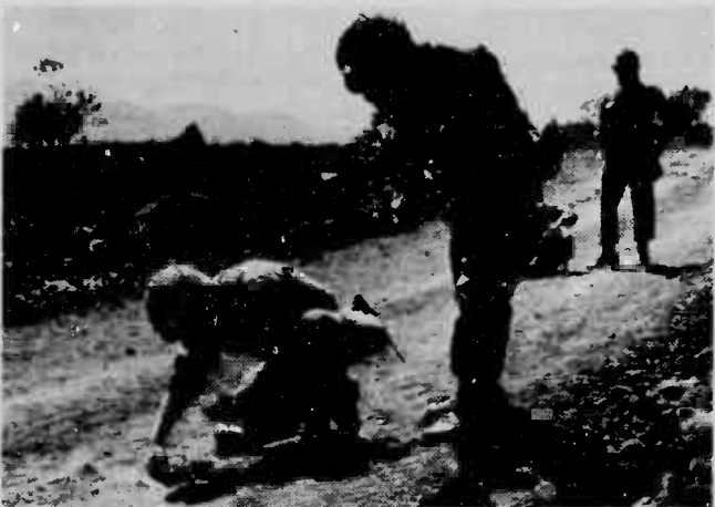
MINED ROAD — A team of combat engineers from B-Engineers clears a roadway for a temporarily halted battalion. Almost all road blocks erected by the aggressors were accompanied by mined approach roads.