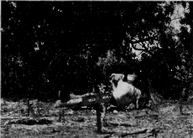
PRISONERS OF WAR — As in any "War", prisoners were taken and interrogated by intelligence personnel attempting to learn about the enemy's strength, location and tactics.