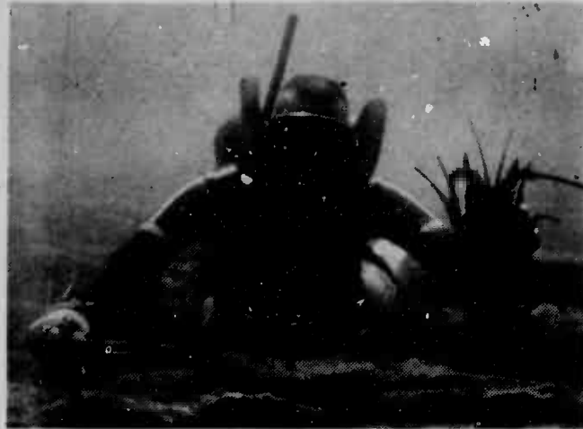
DINNER IN HAND — An Aku Marine captures his share of the delicacies that will be available at the club dive and family fish fry June 28. Festivities will get underway at noon in the Fort Hase Beach area. Prizes will be awarded for the largest edible fish or largest total catch.