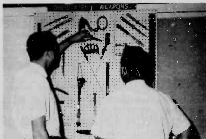
DETECTIVE BUREAU — Two of K-Bay's CID personnel look over a collection of weapons confiscated during some of their investigations.