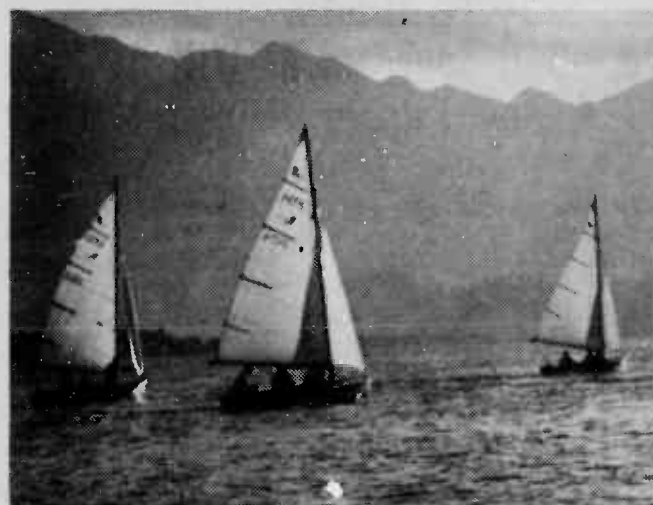
SAILING AT K-BAY —Three of the K-Bay's Rebel class sailboats take to the water in the harbor. The Station Sailing Club offers instructions in the art of sail and general nautical matters. Business meetings are held once a month and the club meets each Saturday for sailing.