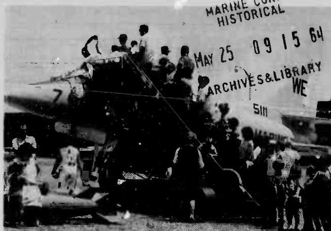
POWER FOR PEACE — Guests at K-Bay's Open House take a close look at an A4C "Skyhawk". The jet attack-bomber was one of the many weapon and equipment displays shown as Armed Forces Week began Sunday.

A contribution to Navy Relief is an investment in a Marine's own welfare should the need arise. If the need never arises he still has the satisfaction of lending a helping hand to a fellow Marine less fortunate than himself.