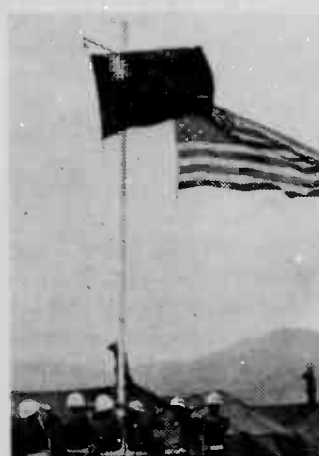
SIDE BY SIDE — "Old Glory" and the Nationalist Chinese flag fly side by side as Colors is sounded at base camp Feb. 17. The Chinese joined BLT 1/4 for Operation Back Pack Feb. 16.