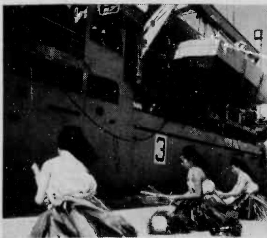
Hawaiian dancers say "Aloha" to Marines of BLT