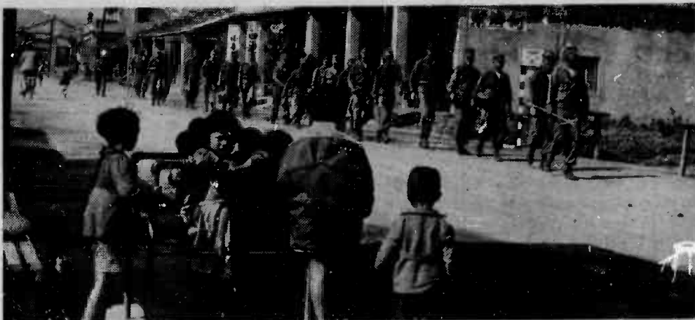
COMMON SIGHT — Company "A" Marines move through a village prior to D-Day learning the terrain they defended against the invading Third Marine Division. Although Marines soon became a common sight, the children of Taiwan never lost their interest in the "ding-how" men.