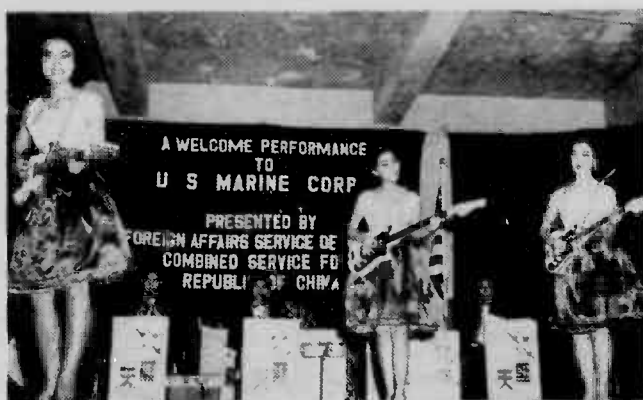
ALOHA TAIWAN STYLE — Three Taiwanese girls give out with popular American songs during a show presented for BLT 1/4 Marines by the Combined Service Forces of the Republic of China.