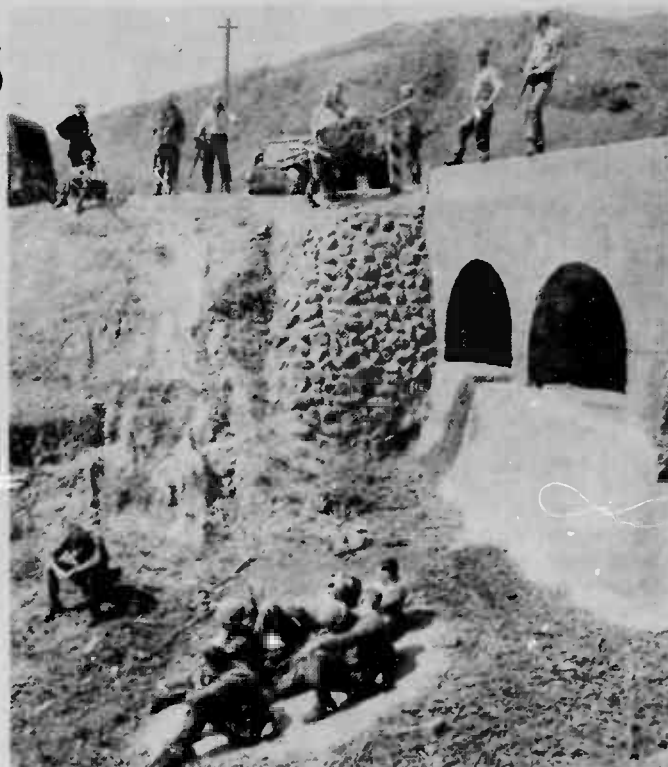
DELAYED ENROUTE — Aggressors of "C" Company stand guard over Marines of the invading Third Marine Division after capturing two vehicles at a road-block. Other units, working behind the "enemy's" lines, set up roadblocks and pulled night raids on invading forces. After D-3 some 3d-MarDiv Marines were thinking "Those guys must never sleep."