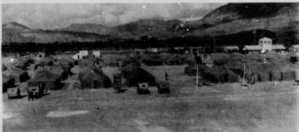
HOME AWAY FROM HOME — BLT 1/4's base camp was located on Heng-Ch'un airfield in Southern Taiwan and served as headquarters for the Tactical Exercise Coordinator. Mountains ranging on three sides of the camp provided tactical terrain for Back Pack.