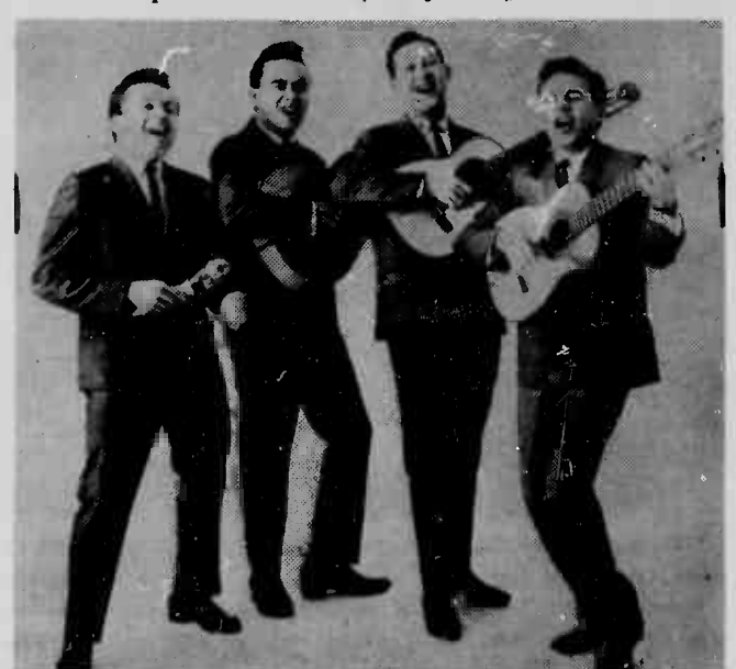
The Four Amigos

day from 10 a.m. to 1 p.m. or buffet from 6 to 8 p.m. Cy and Ann play for your buffet pleasure.