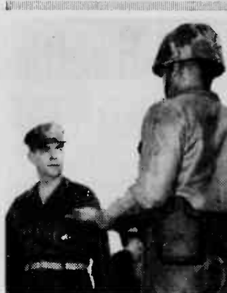
INSPECTION — Gen. Greene inspects honor guard Marines of M-3/4 during his one-day K-Bay visit.