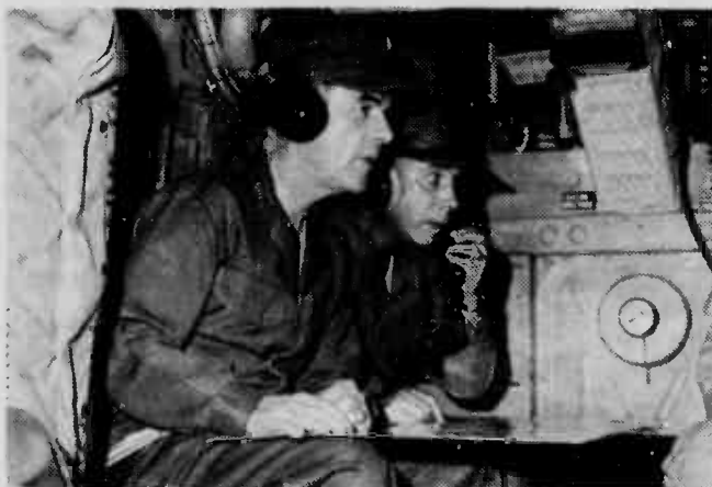
VISITS MOLOKAI MARINES — Gen. Greene, accompanied by BrigGen. Youngdale, gets a "birds-eye" view of Molokai training areas during a helicopter flyover of the terrain. He also visited 1/4 elements undergoing training there.