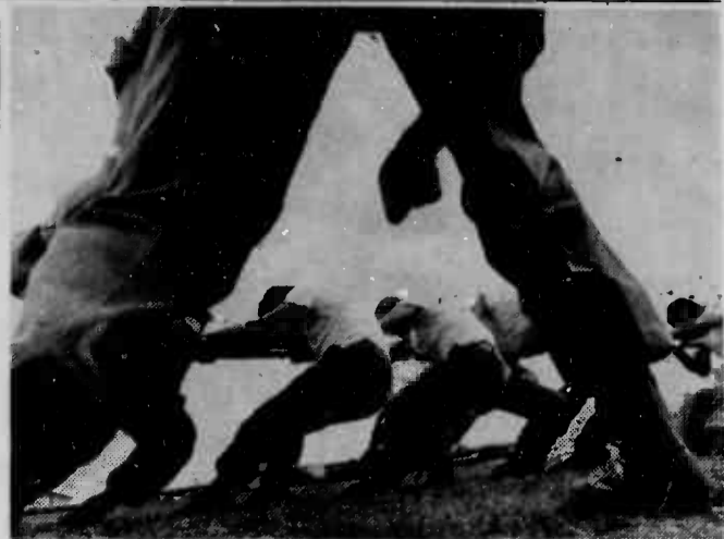
TUG OF WAR — Separate Company Marines battle for top honors in Tug of War finals during the Regiment's annual field meet and gymkhana Dec. 27. Two-Four compiled 235 points to emerge overall winner.