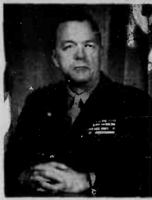
NEW HQMC CHIEF OF STAFF LtGen. Leonard F. Chapman Jr. assumed duties as Chief of Staff at HQMC Jan. 1 when he succeeded Gen. Wallace M. Greene Jr. who became Commandant. Gen. Chapman previously served as Assistant Chief of Staff, G-4, at HQMC.