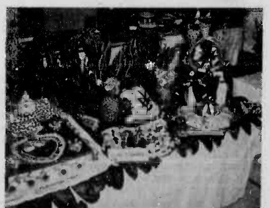
UMMM GOOD! K-BAY CULINARY ENTRIES