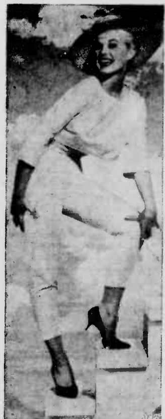
SHAPELY NUGGET — Maybe they didn't like this in the gold rush days, but who'll quibble when it's Dorothy Provine sweetening up the sourdoughs? She'll star in 'The Alaskans,' a new fall TV series.

Breakdown of cases were as follows: 38 loans totaling $1,618.33; eight gratuities for $402.50; three loans converted to gratuities for $168; 18 service cases and 10 layette certificates.