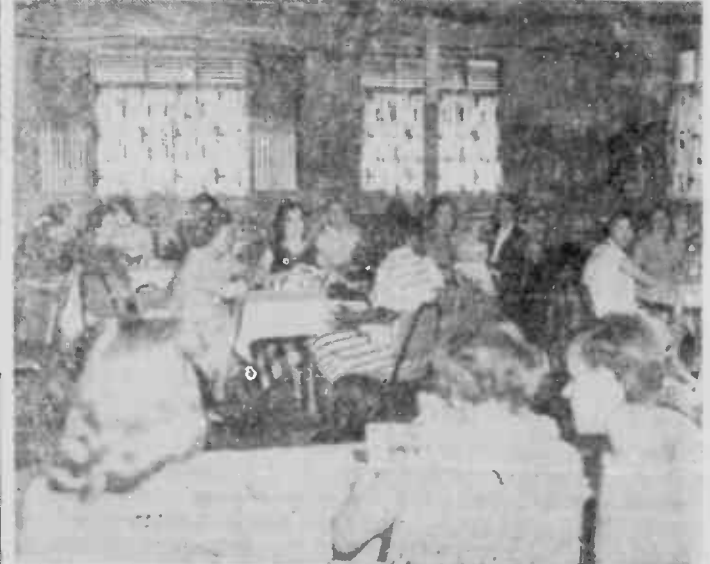
OVERALL SCENE FOLLOWING MEETING Enlisted Wives Club Members In Group Discussions