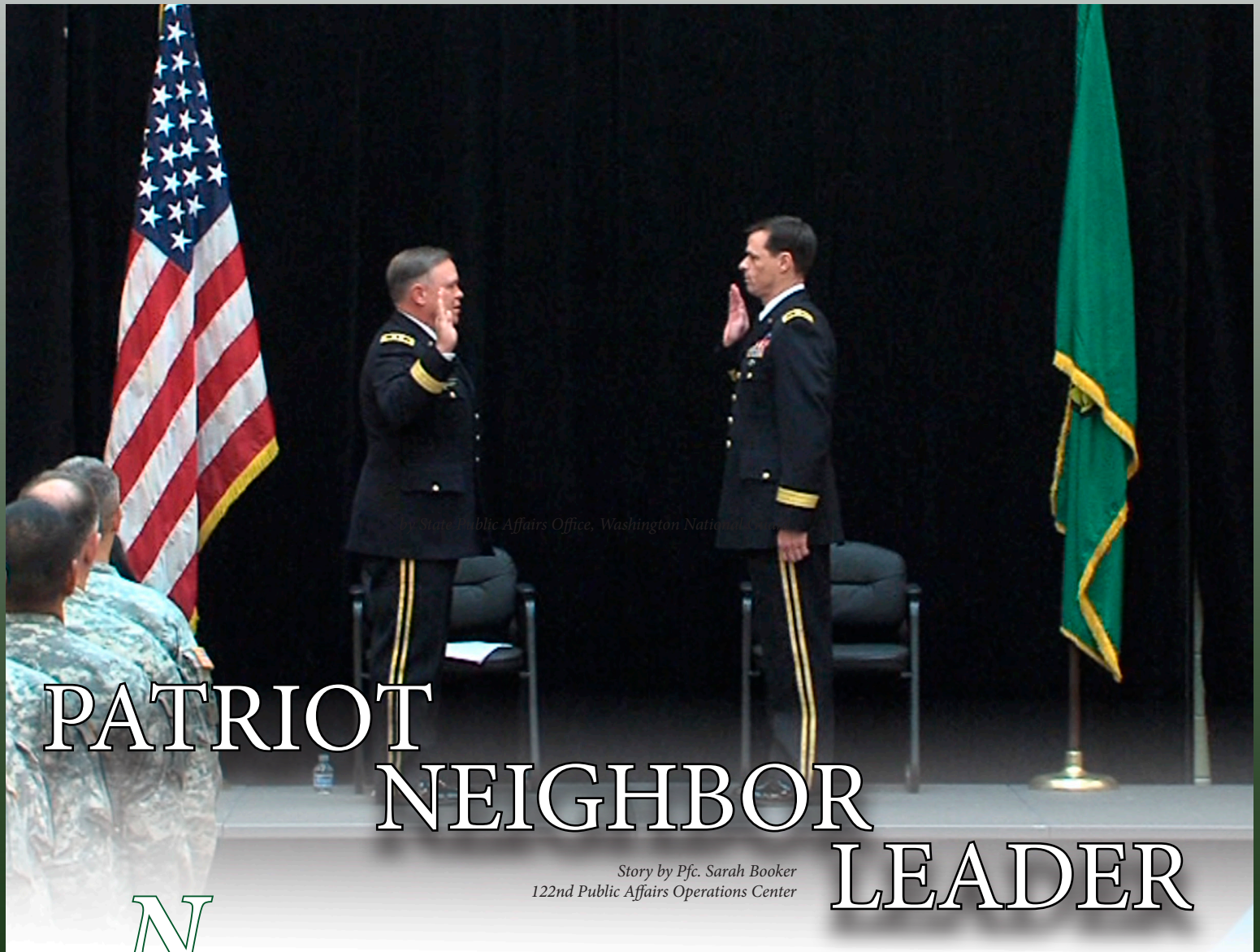
By State Public Affairs Office, Washington National Guard