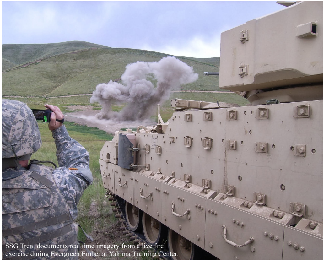
SSG Trent documents real time imagery from a live fire exercise during Evergreen Ember at Yakima Training Center.

transit of disaster relief supplies from various movement control points within the state. It also coordinates law enforcement security for movements. WSG exercised the MCC during the LOGEX of the Evergreen Quake Exercise.