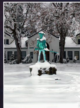
The Minuteman statue in front of Building One, Camp Murray, covered with snow after a large snow storm that hit Western Washington in January 2012.