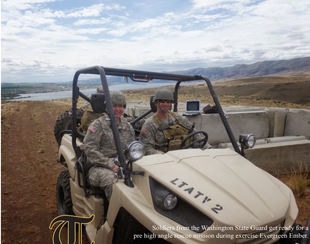
Soldiers from the Washington State Guard get ready for a pre high angle rescue mission during exercise Evergreen Ember.

The Washington State Guard traces its roots to the territorial militia originally organized in 1855. One of more than 20 state defense forces authorized under federal law, and legally constituted under state law, the WSG is one of the three uniformed services of the Washington Military Department under the direction of the adjutant general of the state of Washington.