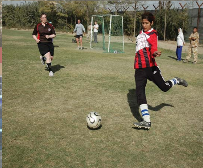
An all-women's soccer game on Oct. 20 highlighted many of the successes of the five-year war on terrorism in Afghanistan.