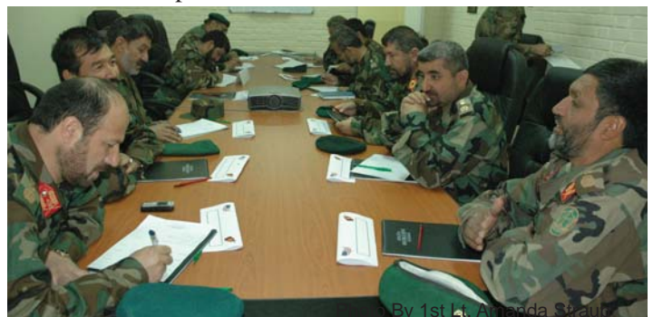
Students of the Senior Command and Staff College register for class.

The SCSC is something all Afghans can be proud of. It is a place where the leaders of their security forces can come together and build a stronger and more brilliant future for their armed forces and for their nation as a whole. It is a facility where bonds, both professional and personal are sure to take root.