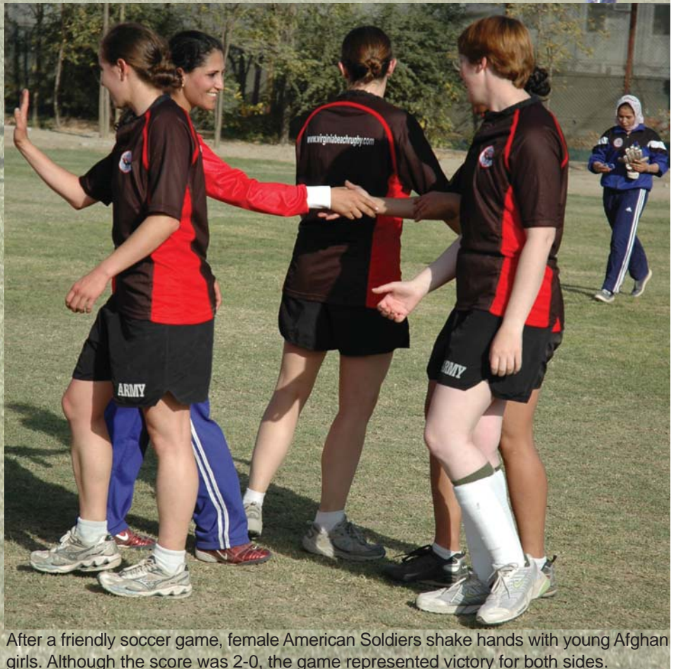
After a friendly soccer game, female American Soldiers shake hands with young Afghan girls. Although the score was 2-0, the game represented victory for both sides.

Five years ago no Afghan could enjoy something as simple as a soccer game in peace and security. The young Afghan girls who played in this game would not have left their houses, much less played soccer. The next time someone says we are losing Afghanistan, look around you at all the little indicators of monumental success, and remember, they haven't been here.