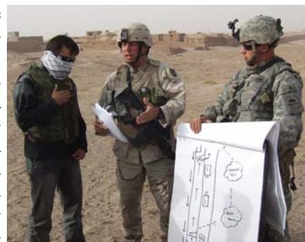
Task Force Phoenix Embedded Trainers in Herat are among the first to tackle training the Afghan National Police.

At the end of the day, no illegal contraband was found, but the ANP and ANA gained valuable